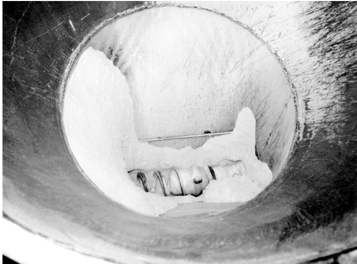
Fig. 1 Moist powdered talc consolidated in a badly designed feed hopper. The operator cleared this by rodding with a broom handle, and when this jammed in the screw it was ejected past him like a javelin!

As a result, many hoppers on plants of all sizes and in all industries suffer from damage from hammering, popularly known as “hammer rash”. The flow interruptions give rise to production difficulties, and the hammering itself requires operators to divert from their other tasks; it commonly leads to safety issues with noise, hand injuries and back strain.