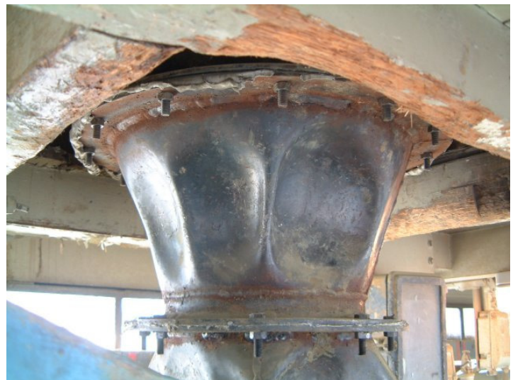
Fig. 2 “Hammer rash” on bins with flow problems – the effects on the bins are obvious, but how much damage has this done to the operators?