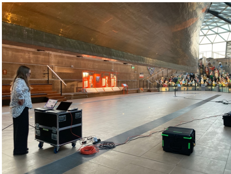
Cutty Sark IR Measurements - 12 February 2025 Floor Plan [Horizontal Plane] Dr Emma Hargreaves

These recordings enabled us to simulate the acoustics within the SHIFT spatial audio lab in Greenwich.