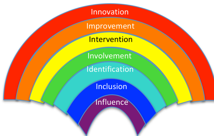
Figure 1. SBI rainbow