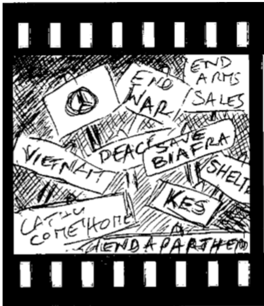
FIGURE 2: PROTEST BANNERS