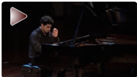
Video 1 (6:31). Mutations (megamix) performed by Zubin Kanga at NIME 2010. Electronics composed/performed by Ratcliffe. © Robert Ratcliffe and Zubin Kanga.

elements of this realisation were restricted. One might compare the tape part to the equivalent of a recorded DJ set: a reproduction of the real thing. Nonetheless, as with the mix CDs that are commercially released by popular EDM DJs, there is an advantage in that Ratcliffe was able to practice and fine-tune his own performance for the tape part, selecting the best realisation for Kanga.