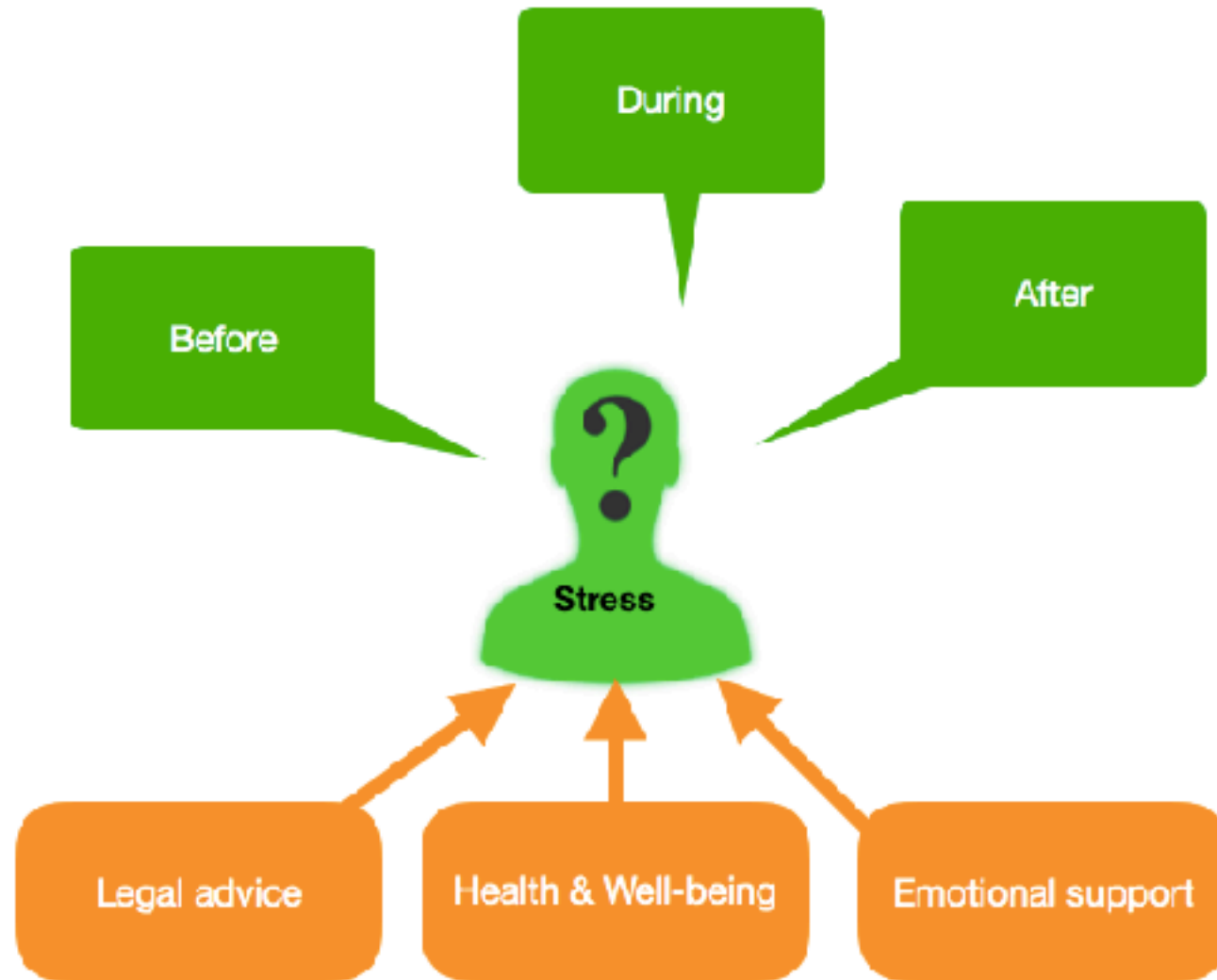
Figure 3. The value of independent advice