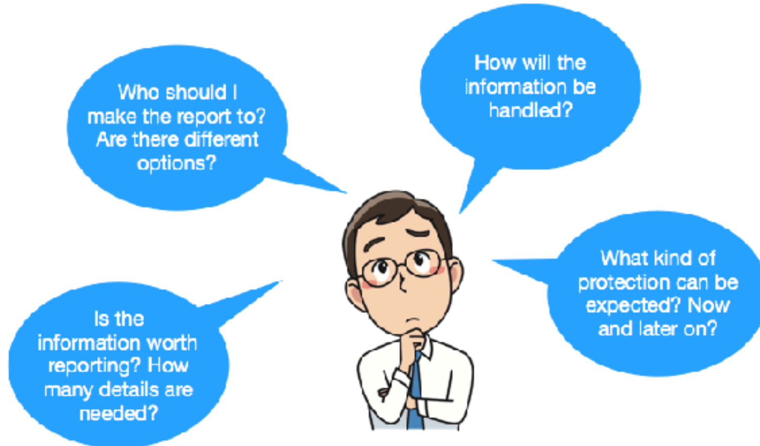
Figure 1. Questions people ask themselves before whistleblowing