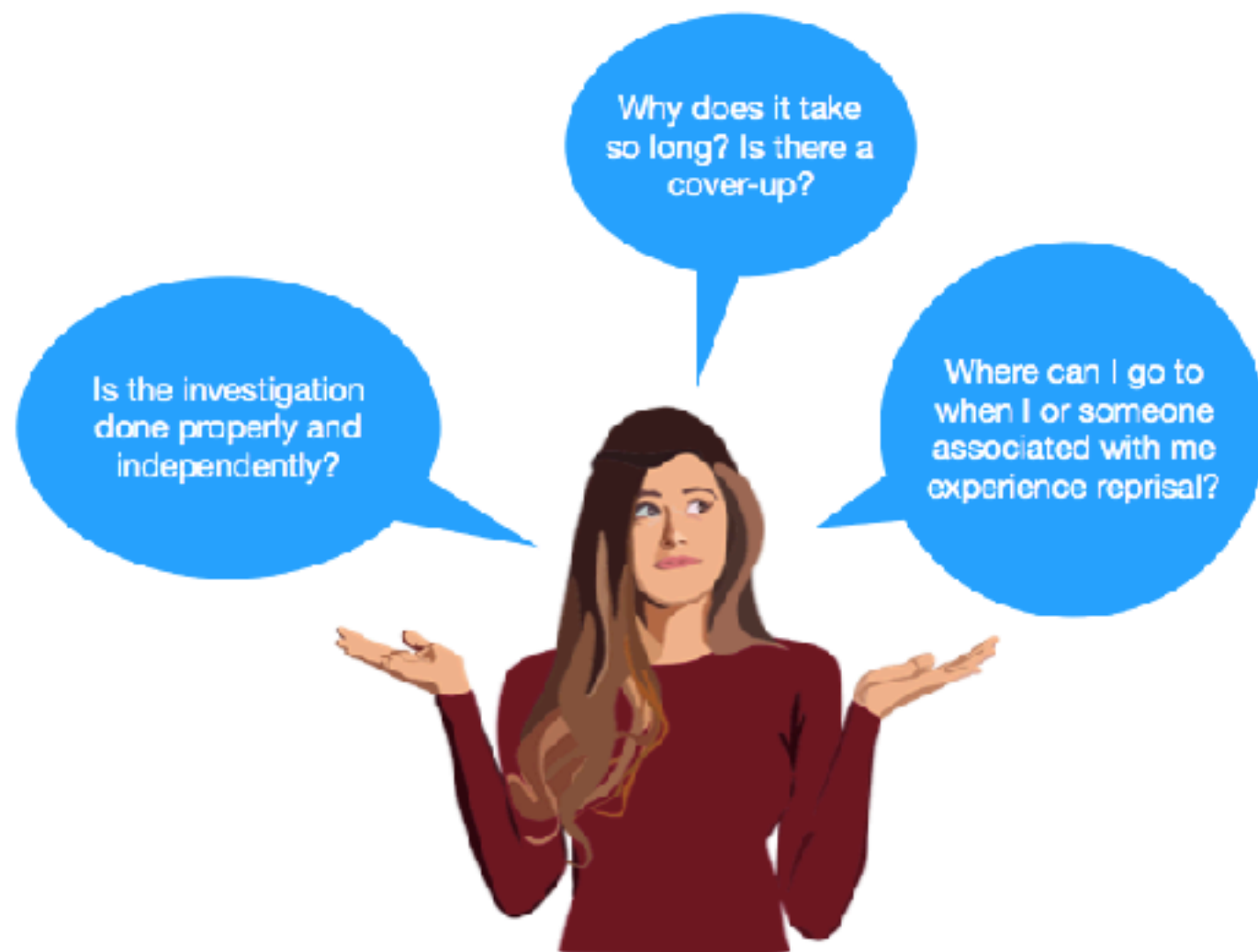
Figure 2. Questions people ask themselves after reporting a concern