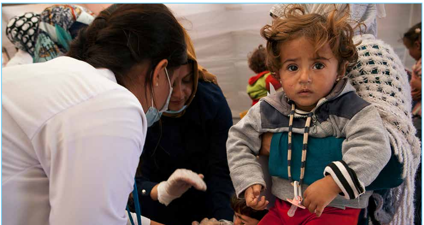
Health workers caring for refugees

Since 2012, in Greece, the surveillance of migrant camps has been transferred to private security companies. Since 2013 this applies also to the migrant detention centres with G4S operating in a number of them (see also 2.6 European Union). 62