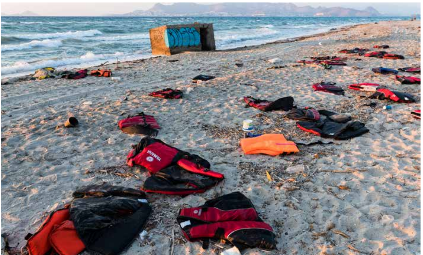
Life jackets washed up on beach in Greece

The privatisation of services does not just affect the quality of the direct services provided to asylum seekers and migrants, it also has an impact on the professional practices of the staff who are involved in these services. Health services are often affected by the tensions between the company contracted to deliver care and the professionals responsible for providing it. A study of professionals working within detention