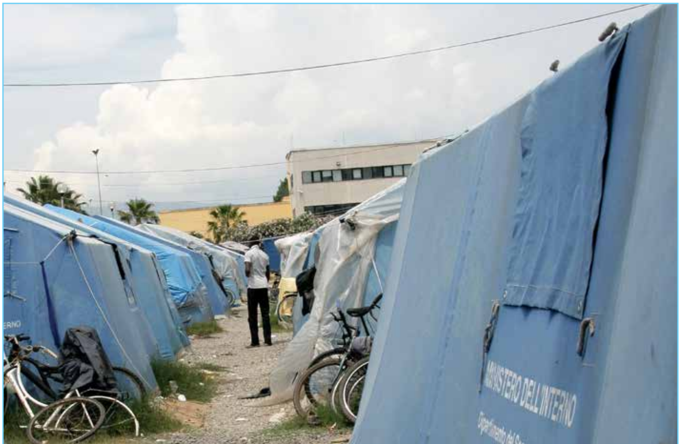
6 June 2016 Rosarno (Italy)