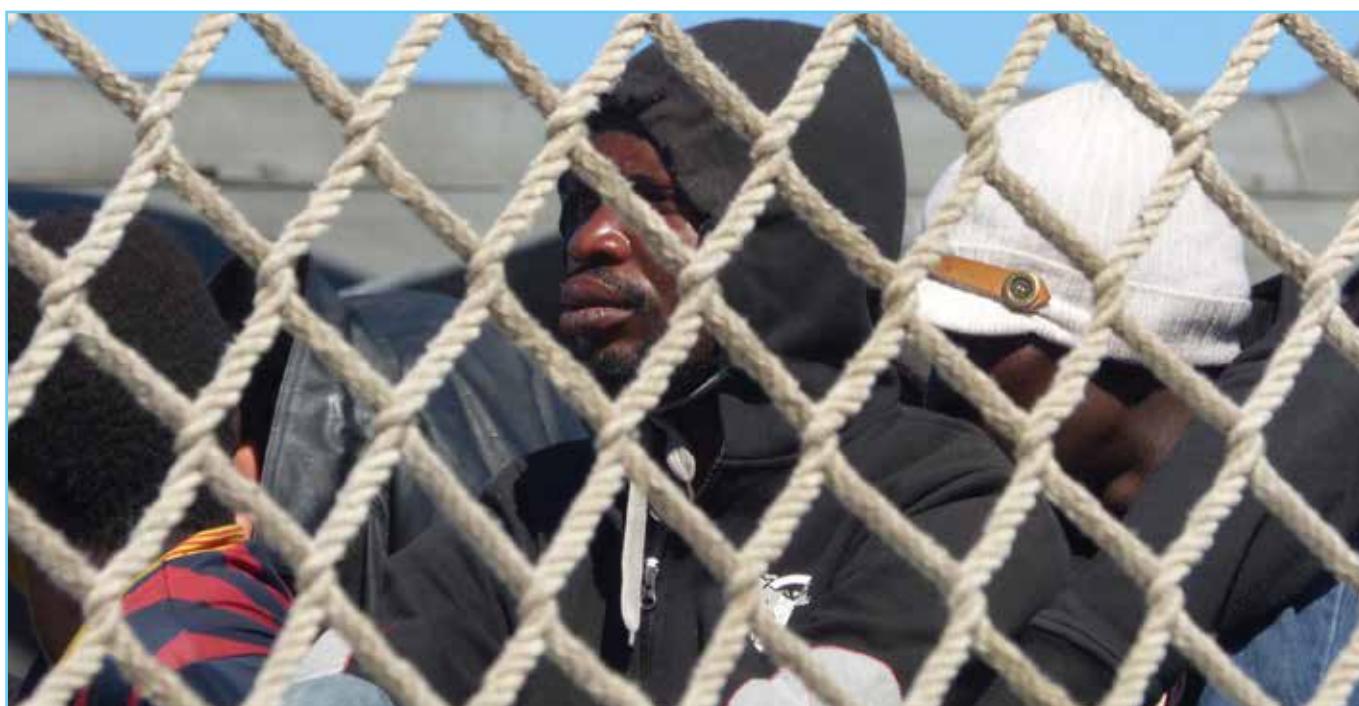
4th may 2016, Reggio Calabria (Italy)

Following the arrival of large number of refugees, for the main fleeing war in Syria, at the EU borders, the EU council agreed in June 2015 a new “hotspot-based approach” as a model of operational support by the EU agencies to Member States faced with disproportionate migratory pressure. The stated objective is for the EU agencies - European Asylum Support Office (EASO), Frontex and Europol- to support those member