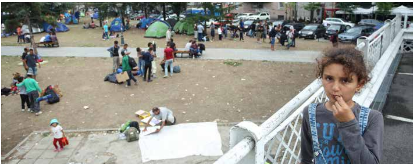
Syrian child in front of make-shift refugee camp