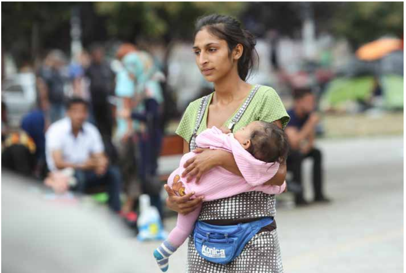
Syrian Refugee woman with child

Furthermore, as evidence in this study shows, States are disengaging from this human rights obligation and relegating it to the private sector and through forms of off-shoring and outsourcing.