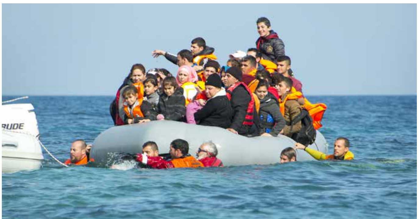
Refugees arriving in Greece on rubber life-raft