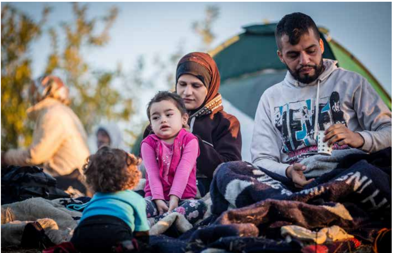
Family in refugee camp

All the companies mentioned in the report can be found in appendix A.