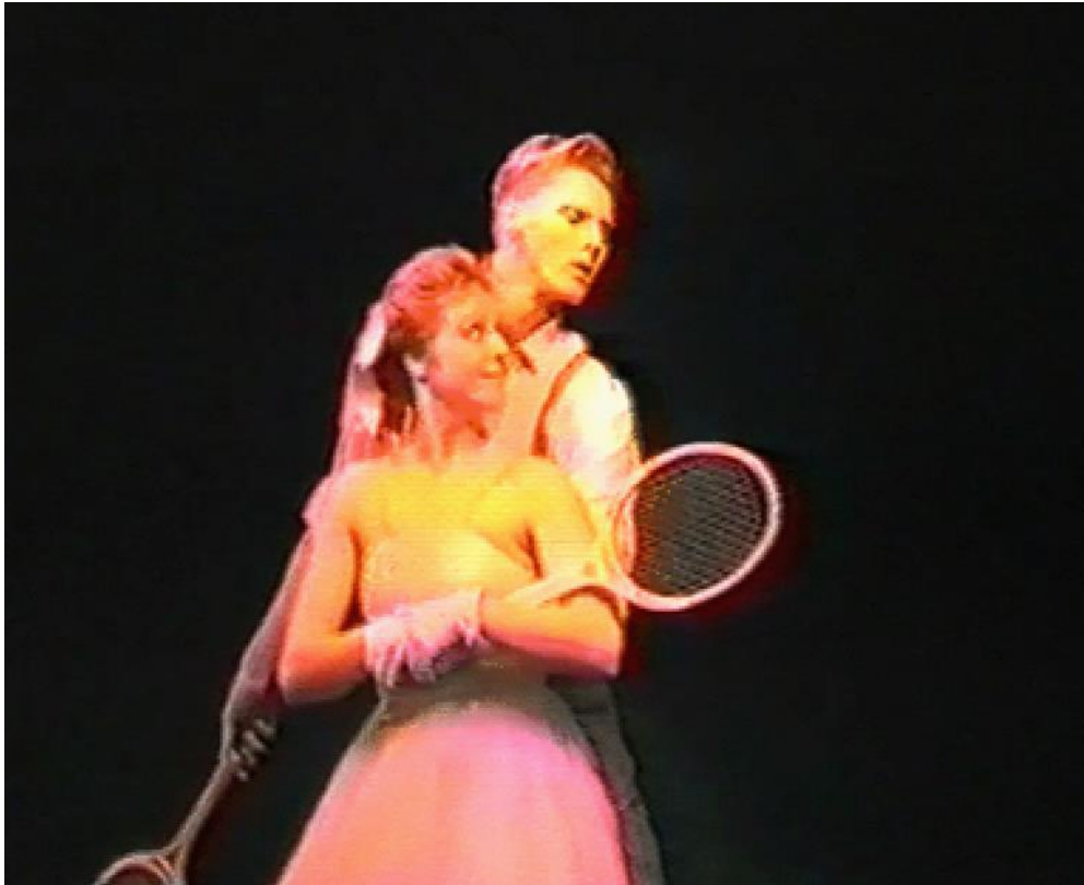
Sporton & Norman, Double Take , 1986