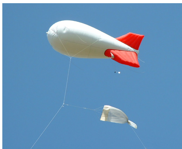
Fig. 1. Sampling insects at ca. 200 m above ground by means of a net attached to the tethering line of a 6-m long kytoon. The detachable bag at the end of the net has just been closed-off, prior to winching down of the kytoon to ground level and recovery of the sample. The wind-run meter can be seen suspended below the kytoon tail.

We took aerial samples of insects at ca. 200 m above ground with a drogue net of 1 m diameter aperture suspended from a tethered helium-filled kite-balloon (kytoon) (Fig. 1). The sampling site, at Cardington Airfield (52°06'N, 0°25'W), Shortstown, Bedfordshire, in southern England, has an official aircraft exclusion zone which allowed the kytoon to be flown above the Civil Aviation Authority limit of 60 m. Sampling was carried out in the years 1999, 2000, and 2002–2007, in various months between May and early September, but mostly in July (Table 1). [The aerial netting was designed to support our radar observations (e.g. Hu et al., 2016), and insect numbers detected by the radar were extremely low outside the May–September period.]