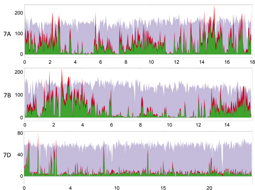
Figure 2 Single-nucleotide polymorphism (SNP) distribution across the syntenic builds of 7A, 7B and 7D. Raw SNP density numbers (SNPs/50 kbp) are represented in green, SNP densities normalized for coverage are represented in red, and read coverage is represented in blue. The X-axis represents the position on the syntenic build (Mbp) from the short-arm telomere (left) to the long-arm telomere (right).

species to produce hexaploid bread wheat. By sequencing and assembling the low copy and unique gene regions of isolated chromosome arms representing homoeologous chromosomes, we can observe the impact of this history on genome structure.