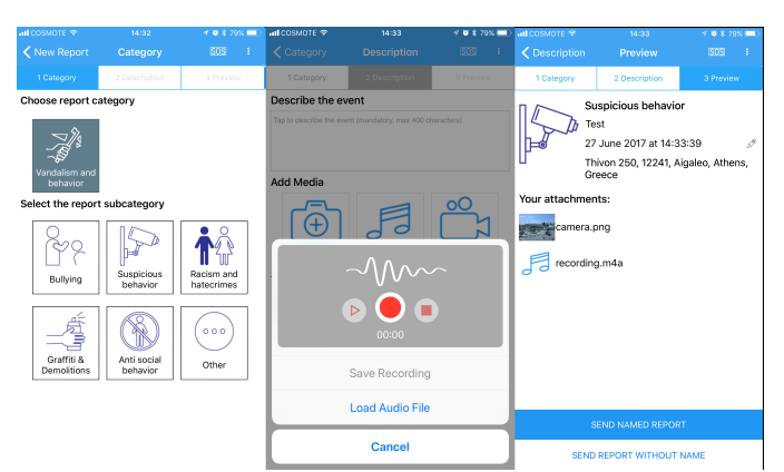
Figure 2: A new Report using the mobile phone application

feedback received during a mockup validation process, the end user applications were designed to be simple and easy to use, especially as regards the generation and submission of a report. A user can create and send a new report in just three steps, following the instructions provided in each one. In the first step (s)he can choose from a list the category of the report, and select the report's location. In the next step, a small description is required, and optionally the user can also attach media files such as image, audio or video, either preexisting or new using the devices' sensors (camera, microphone). In the final step, the user can review the report to be sent, modify, if needed, the date and time of the event and complete the submission, either including his/her identity or selecting to send a report where his/her personal data can be hidden (details on how this is implemented, on the privacy protection sub-section).