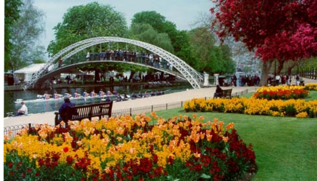
The Embankment and River Ouse, Bedford

Full paper: 31 March 2005 Final paper: 31 May 2005 Registration: 30 June 2005