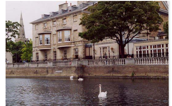
View from the River Ouse, Bedford

All papers will be refereed by international experts and published in the conference proceedings. It is proposed that selected papers will be published as a book by a reputable academic publisher. Further selected papers will be published in special issues of international journals, including Advanced Manufacturing Technology, Production Research and Business Process Management.