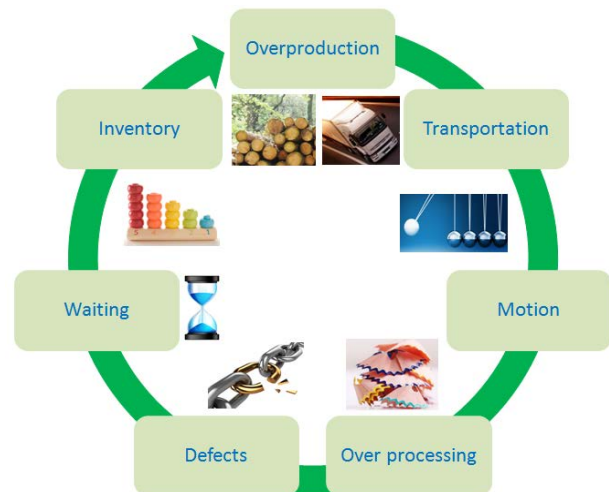
Fig. 1. The Seven Deadly Wastes of Lean Philosophy.

Presently, the service industry is trying to improve its performance by embracing the continuous improvement process so as to stay competitive and satisfy their customers. Hence for them to achieve this there is a need for this service industry to adopt the Lean production practice as a full business strategy. Below are the deadly wastes that affect service industry. The main aim of Lean production is to eliminate all type of waste within the production process. Waste includes all activities that do not add value to organisations or customer. It is any activity that customers will not pay for; thus it is important for organisations to identify the concept of this waste and reduce it. Earlier research by Taiicho Ohno design of seven wastes or "Muda" which form the core of "lean philosophy" that is faced by companies on how to identify and reduce them.