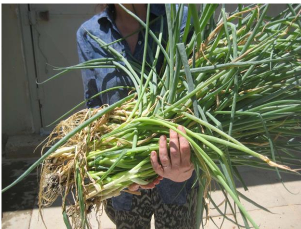
Figure 7. Over mature spring onions at harvest in July 2011