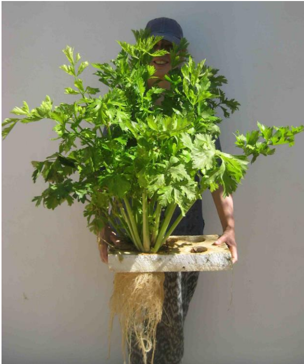
Figure 6. Photograph of mature celery plant shown within polystyrene raft with healthy root and leaf growth