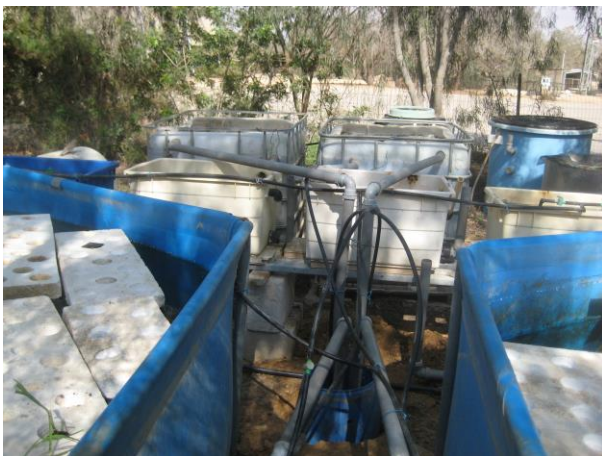
Figure 2. Photographic view of aquaponic systems