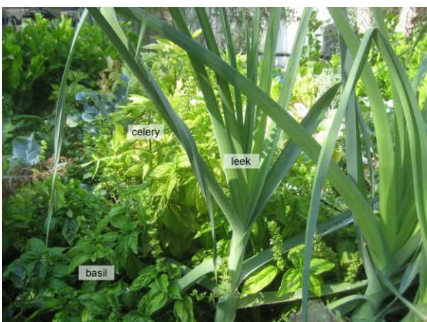
Figure 3. Photograph of plants within system at maturity

Plants that did well included aubergine ( Solanum melongena ), bell pepper ( Capsicum sp. ), kohlrabi ( Brassica oleracea ) and tomato ( Lycopersicon esculentum ) as noted in Table 6.