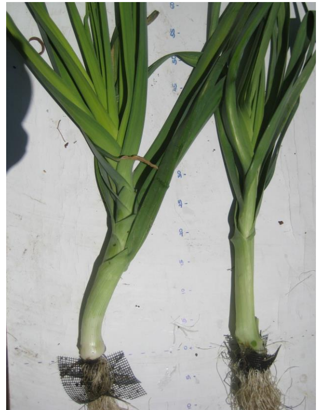
Figure 4. Photograph of leeks grown in the aquaponics systems. (Compare with soil grown leeks in Figure 5), July 2011