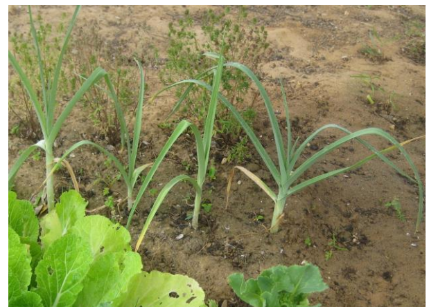
Figure 5. Photograph of leeks grown in soil and planted at the same time as those in the aquaponics systems, July 2011