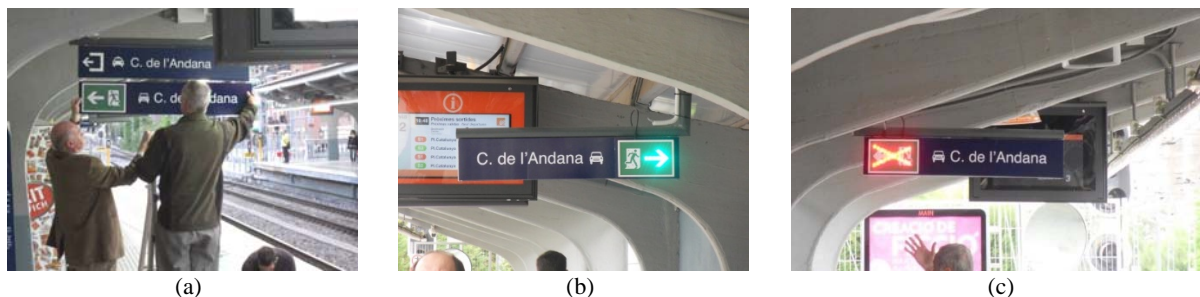
Figure 3: (a) The standard static emergency exit sign and the ADSS (b) flashing exit sign and (c) negated sign.

The second trial, TS2.2, consisting of 152 participants, conducted one week later on the 2 nd June, was to assess the participant reaction to the ADSS (see Figure 3b and Figure 3c), which was activated at the same time as the alarm during the trial. The ADSS was configured to direct all participants towards an intended exit, Exit D located at one end of the platform, according to a specific evacuation strategy (see Figure 4 bottom). This was not the nearest exit for the majority of the participant population and therefore required the population to adopt a different behaviour from that exhibited in the first trial. The only intended difference in the trial procedure between the two trials was the signage systems employed (see Figure 4).