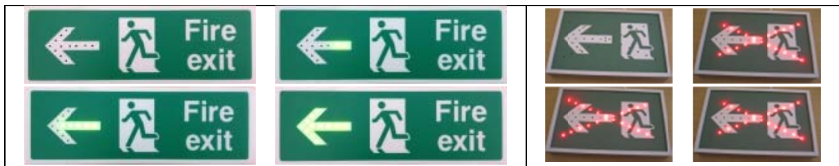
Figure 1: The flashing light signage design (left) and the negated no entrance signage design (right) used in the ADSS.

In this paper we present a series of full-scale evacuation trials that test the ADSS in a rail station application. The specific purpose of the trials was to assess the effectiveness of the ADSS, which adopted the two signage design concepts, in comparison with the standard emergency exit signage system.