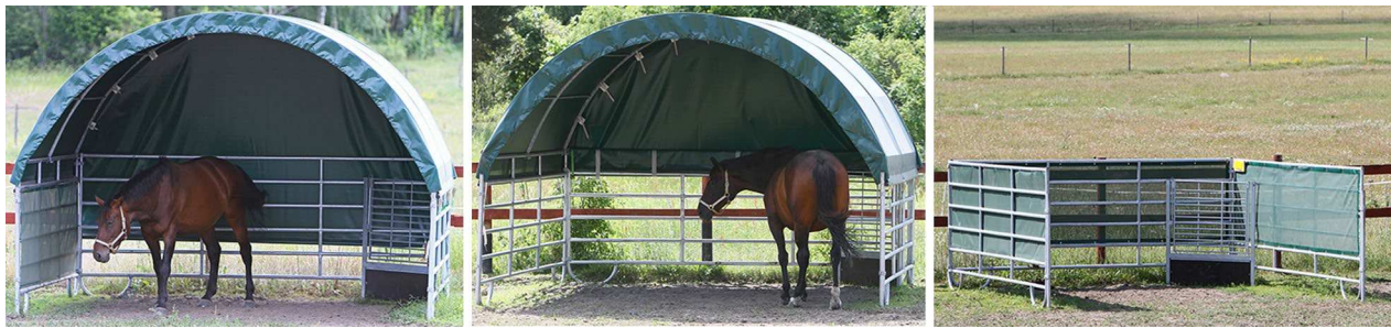
Fig. 2 Closed shelter A ( left with opaque plastic roof, opaque plastic on the rear wall opposite the entrance and transparent wind nets on two sides, open shelter B ( middle with opaque plastic roof and opaque plastic covering the upper half of the rear wall), and shelter C without roof ( right wind nets on three sides). Shelters were purchased from Mobile Covers (Cover all Europe GmbH, Groß Lüdershagen, Germany) and measured 4 × 4 m (height 3.15 m). The fence elements consisted of 2 mm thick round steel (45 mm in diameter) and the distance between fence elements was 21.5 cm ( first bar at 23 cm off the ground). The height of the walls measured 130.5 cm. The roof was a polyvinyl chloride fabric (670 g/m 2 ). Sticky paper traps were placed in the right corner in each shelter behind a metal gate.

and 0200 to 0600 h (surveillance camera, Qihan Technology Co., Ltd., China) and during daytime from 0900 to 1200 h and 1300 to 1600 h by two observers sitting outside the paddocks at a distance of 30 m. Other behaviour, including shelter use was recorded via direct observations at 5 min intervals according to the ethogram in Table 1.