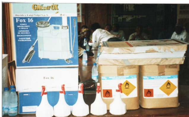
Figure 1 Essential equipment: knapsack sprayer, hand sprayers (white containers with red nozzle), \text{KIO}_3 and instructional literature for small scale salt iodation.

The potassium iodate in use ( \text{KIO}_3 , molar weight = 214.9 g/mol, estimated cost $18/kg) originated from the INQUIM Company in Chile was purchased through UNICEF. It conformed to U.S. Food Chemical Codex specifications [7].