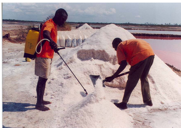
Figure 2 Iodation of salt using a knapsack sprayer and manual mixing of a 2-ton salt heap.

The iodine levels achieved using the diesel/petrol-powered cement mixer recommended as an iodate mixing machine [24] were compared with those achieved by the manual mixing method using the mat/polyethylene sheet. For all heaps studied, the workers used a cropper (a piece