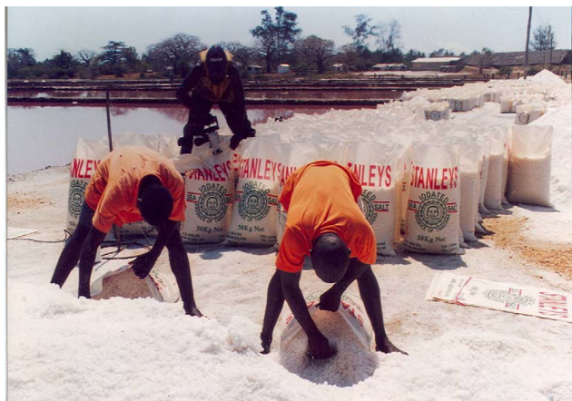
Figure 3 After iodination the process of packaging salt from the heap results in further mixing of salt with iodate and the potential to improve homogeneity.

of flat plastic or wood) to package the salt into the fifty-kg bags (Figure 3).