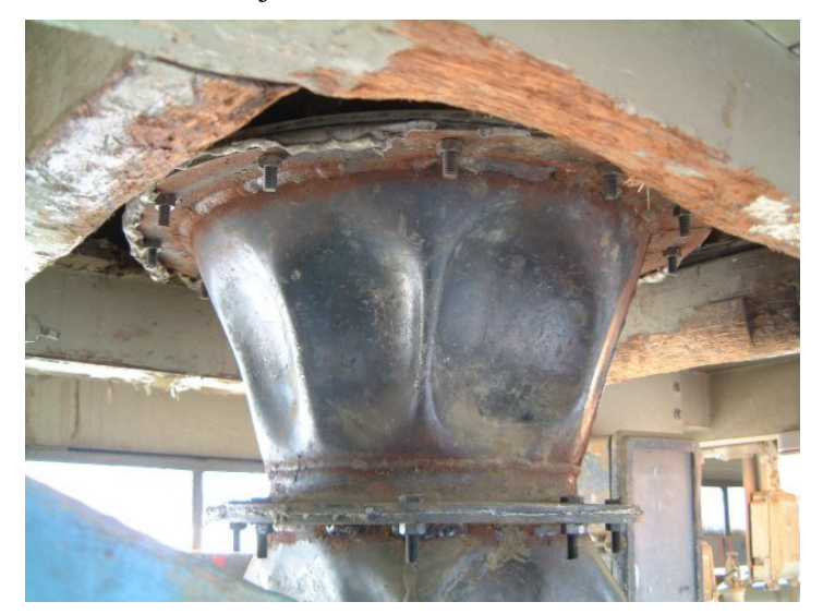
Fig. 2 "Hammer rash" on bins with flow problems – the effects on the bins are obvious, but how much damage has this done to the operators?