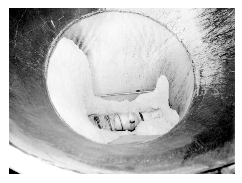
Fig. 1 Moist powdered talc consolidated in a badly designed feed hopper. The operator cleared this by rodding with a broom handle, and when this jammed in the screw it was ejected past him like a javelin!

As a result, many hoppers on plants of all sizes and in all industries suffer from damage from hammering, popularly known as "hammer rash". The flow interruptions give rise to production difficulties, and the hammering itself requires operators to divert from their other tasks; it commonly leads to safety issues with noise, hand injuries and back strain.