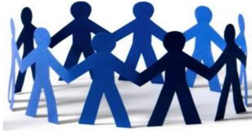
The Social PSV