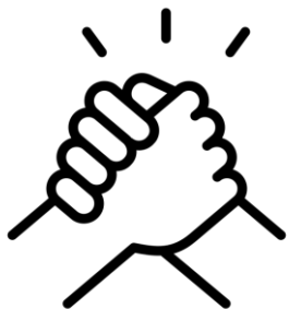
Created by Romaldon