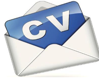
The Career PSV