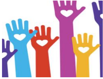
The Altruistic PSV