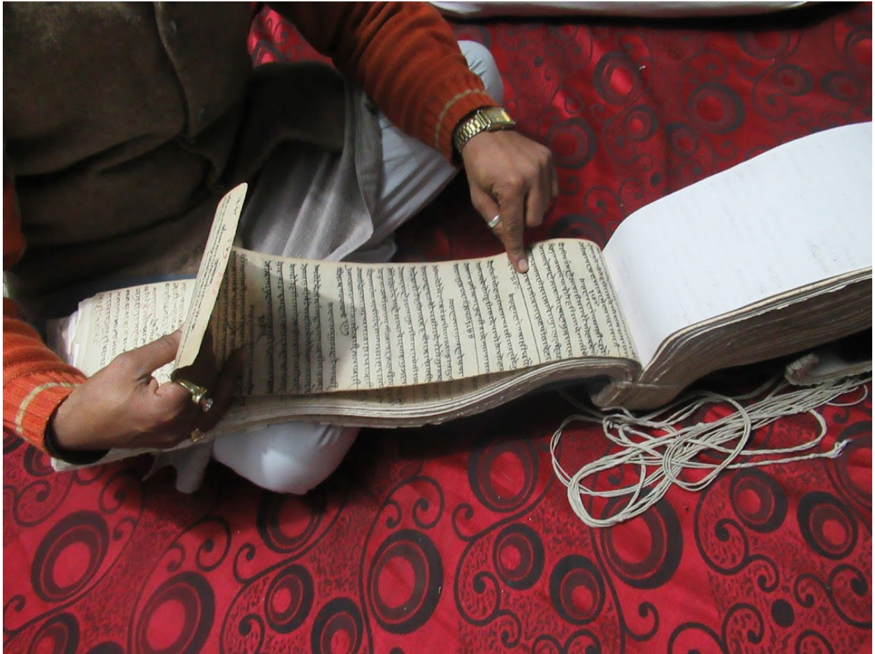
Figure 1. Image of a Panda in Haridwar, India, looking up the family genealogy register