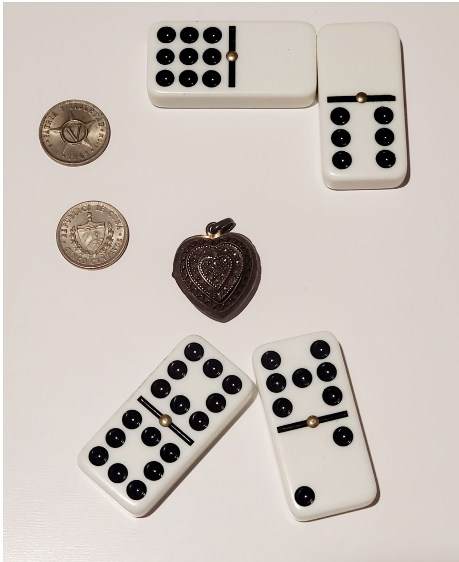
Figure 3. Researcher 3's Dominoes tiles, along with two silver coins that are currency from Cuba. The coins are dated 1961, a time when both my paternal and maternal families were still living on the island. The coins read, 'Patria y Libertad', Spanish for homeland and freedom. The heart locket in the middle belonged to the researcher's paternal grandmother and houses a photo of when the researcher was 5 years old.