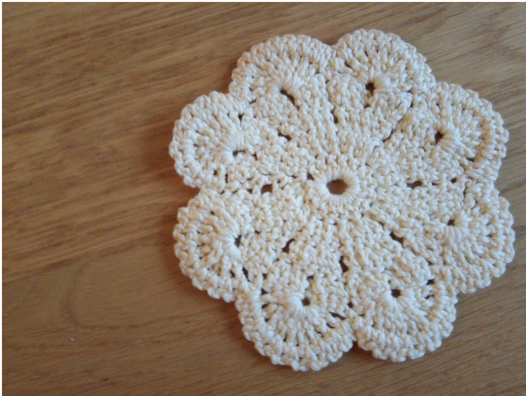
Figure 2. Researcher 2's memento from their grandmother's annual family gathering