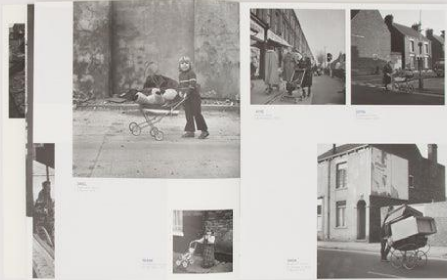
1941 The Daily Mirror