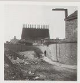
1978 This is the site of the former... The building was built in the 1930s... and was used for... The site is now a... and is being... The building is... and is being... The site is now a... and is being...