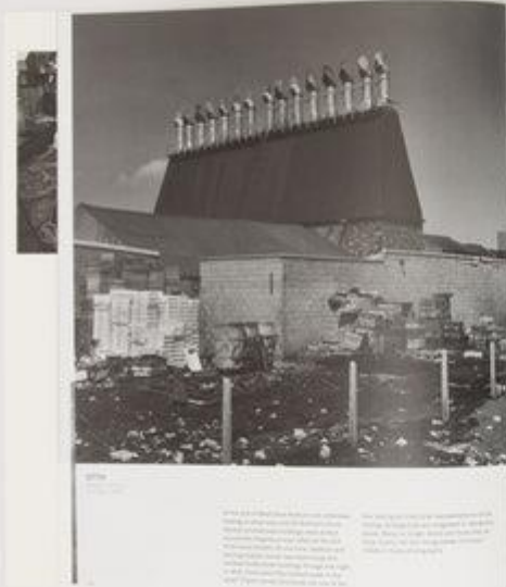
1978 This is the site of the former... The building was built in the 1930s... and was used for... The site is now a... and is being... The building is... and is being... The site is now a... and is being...