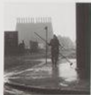
1978 This is the site of the former... The building was built in the 1930s... and was used for... The site is now a... and is being... The building is... and is being... The site is now a... and is being...