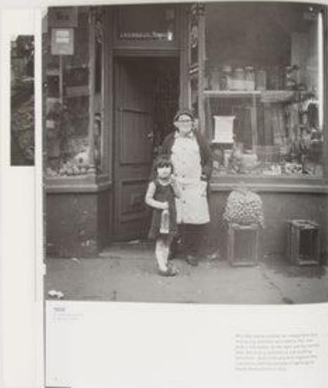
1978 This is the site of the former... The building was built in the 1930s... and was used for... The site is now a... and is being... The building is... and is being... The site is now a... and is being...

I was shocked. A busy shop at the heart of the community and suddenly it's gone. I was recording the end of an era.