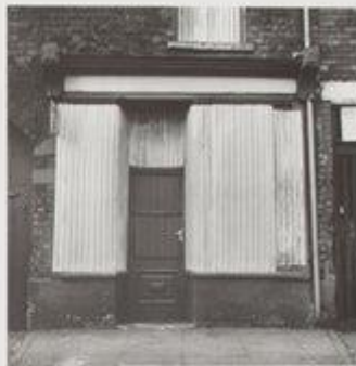
1978 This is the site of the former... The building was built in the 1930s... and was used for... The site is now a... and is being... The building is... and is being... The site is now a... and is being...

I was shocked. A busy shop at the heart of the community and suddenly it's gone. I was recording the end of an era.