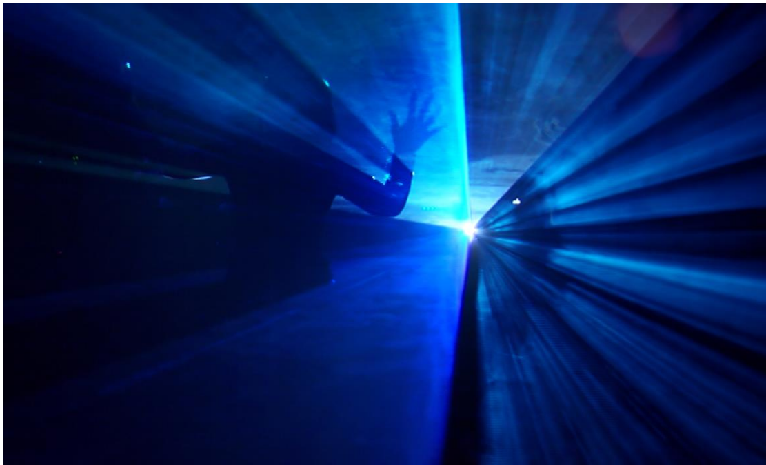
Figure 4: Animated circles creating infinite tunnels of light (Watkins, J., 2022)

To further explore increasing the sensual and sense of touch through scale, I take my work into real three-dimensional space by creating an installation of animated light in a haze: Tactile Vision (Watkins, J., 2022). By projecting animated circles through a haze two-dimensional animations become three-dimensional tunnels of light (Figure 4).