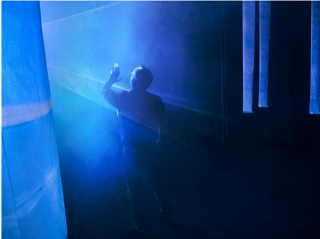
Figure 6: Touching the light (Watkins, J., 2022)

Film is associated with fixed-screen experiences reaching out and touching the projections is an affecting experience. The animations reacted to touch as the participants cast shadows into the light tunnels and the haze moved as they dragged their fingers through the stream of light. Projections draped over their figures as they interacted with them. Because of this interaction each performance was unique and each participant had a completely individual and unrepeatable experience (Figure 7). Watching the participants reactions it was clear that visceral surprises combined with touch to enable being embodied, strongly present in the moment, in a flow-state, alternating with 'soft fascination' (Kaplan and Berman, 2010, 44). As an intervention aimed at restoration of attention through embodied practice the installation was successful.