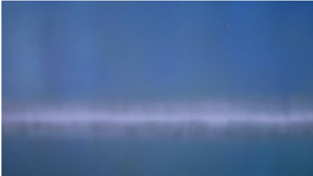
Figure 5: Animated horizon line (Watkins, J., 2022)

They are free to walk around and through the installation, to examine, play with and film it. Tactile Vision and Voice is created on a theatrical stage big enough to aid immersion (Griffiths 2008). I added texture to the perfect digital circles by projecting my animation onto imperfect surfaces: the ever-evolving haze, translucent tracing paper and the folds of black curtains. This post-digital approach increased the textural touch-ability of the animation. The immersive, affective nature of the installation was also increased through a series of visceral surprises: light in the dark theatre, being inside the work, seeing the light form 3D shapes in the ‘air’, being able to touch and play with film (Figure 6).