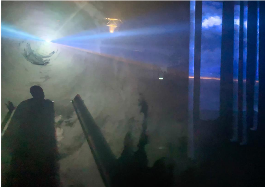
Figure 7: Interacting with Tactile Vision and Voice (Watkins, J., 2022)