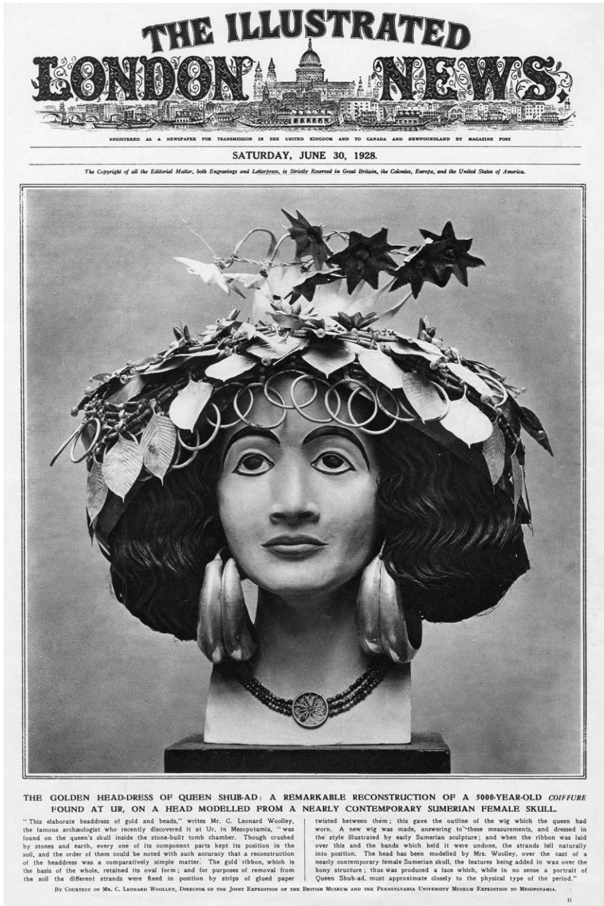
Figure 2. Queen Puabi's reconstructed head and headdress on the front page of The Illustrated London News, 30 June 1928.