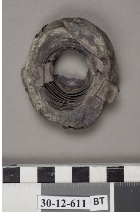
Figure 3. Rolled-up silver hair ribbon.

Courtesy of the Penn Museum, object number 30-12-611.