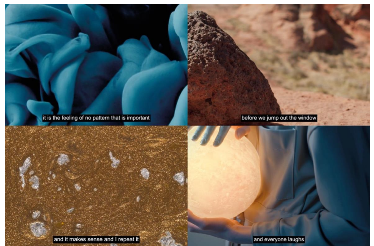
"patterns, rocks, gold, planets," collage created for select important things (2022). Jane Frances Dunlop.