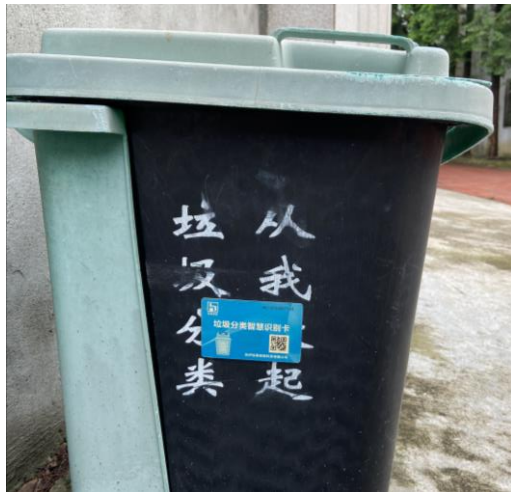
QR code in garbage bins