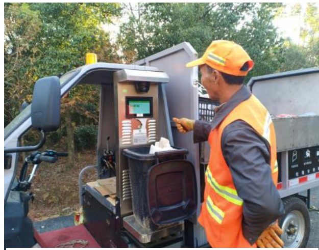
Garbage collectors using RFID technology