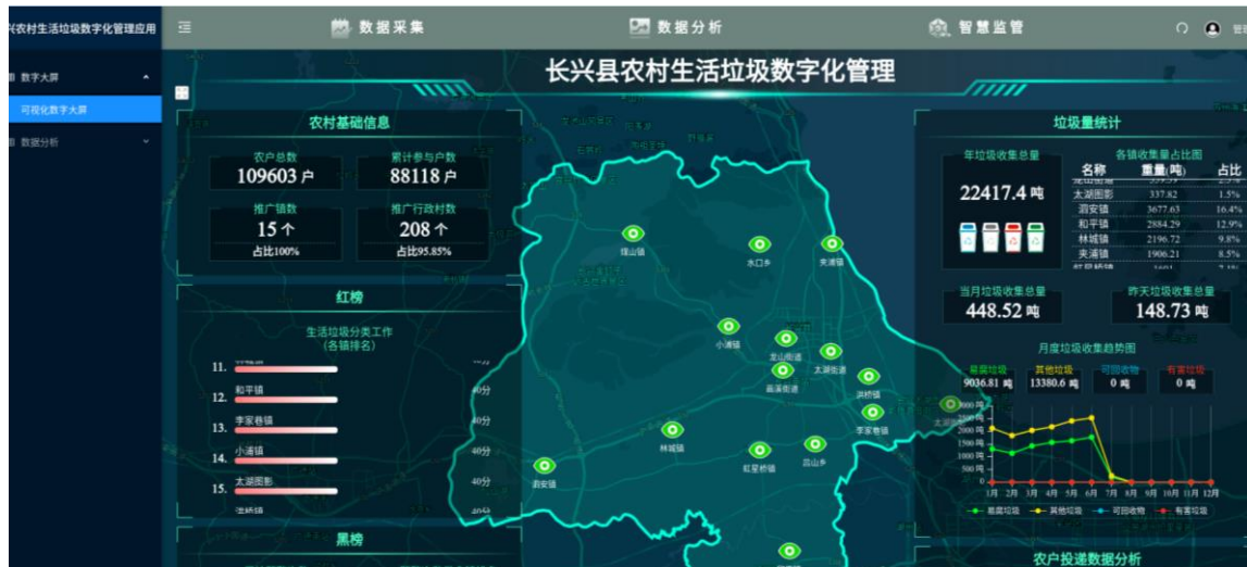
Waste-sorting monitoring system in Changxing County