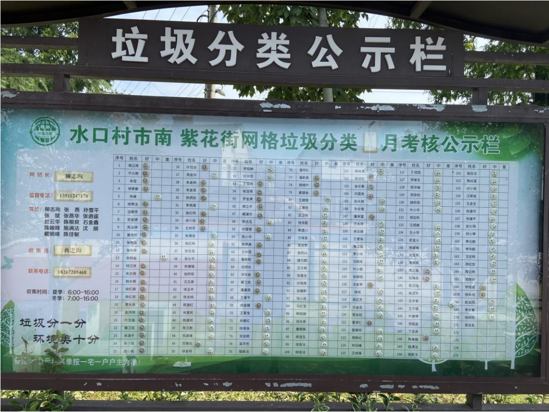
Figure 4: Monthly evaluation of waste-sorting performance in Shuikou Village (on a household basis), presented in the village’s waste-sorting bulletin board

bulletin board, which is posted monthly in public areas of rural communities (D-5). These results are visible to many villagers, as they gather in these public areas for daily leisure, chatting, and exercise. Through the public evaluation measures, stakeholders (governmental officials, neighbors, and tourists) are fully aware of how residents are behaving in the waste-sorting campaign. For those who do well, a mobile red banner is given to hang on the entrance of their yard in the coming month, which makes them proud among neighbors. Those who do not perform well in waste-sorting are not punished economically. However, being rated with a crying face is something bringing shame among their neighbors.