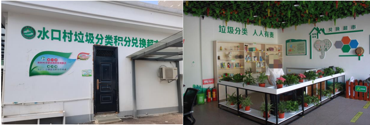
Figure 5: Waste-sorting store in villages, where villagers can exchange some necessities

waste. In this case, “we established waste-sorting stores in villages, setting the price of recycling waste. Residents cannot get cash income. They, however, can use the income to exchange daily necessities in the store. It brings convenience to residents and is thus welcomed.” (I-2).