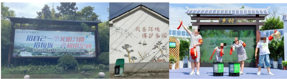
Environment education slogans in public areas

and lowly-educated, the classification knowledge presented in the traditional textual style is very complicated. Thus, how to make waste-sorting knowledge more approachable is the core of environmental education. Local governments have extensive communications with villagers. They encourage villagers to innovate the styles of environmental education to enhance the effectiveness of the campaign. The consciousness-raising and relevant knowledge was thus innovatively incorporated into local humorous talk-shows, which are comic dialogues drawn from residents' real-life accidents and incidents. A local government official stated, “Owing to the combination of humor, the waste-sorting knowledge in local talk-show travels well in rural communities. This style of education, using local wisdom, should be applauded. It offers insights for much community work.” (I-7, D-2). Also, the government actively adopts villagers' suggestions to improve the effectiveness of policy implementation. For example, “We used to collect household waste in the evening time. Some B&B hosts suggested we collect the household food waste at night when they end business of the day. We took their advice and changed the waste collection time to meet small businesses' needs.” (I-2).