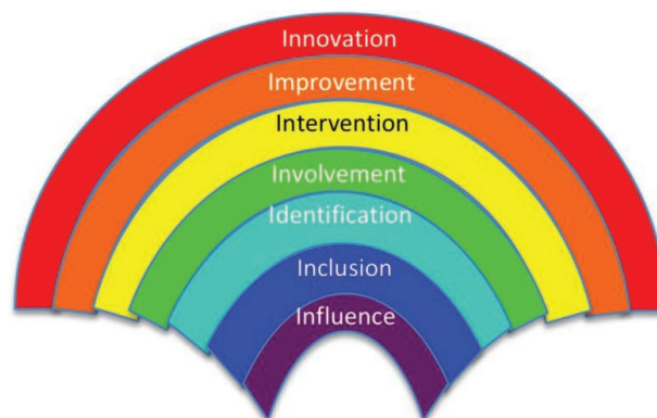
Figure 1: SBI rainbow.

Due to the unconventional approach required for this type of review, searches informally commenced in May 2017 once the change in application was identified as beginning to emerge as a field. By November 2020, due to the COVID-19