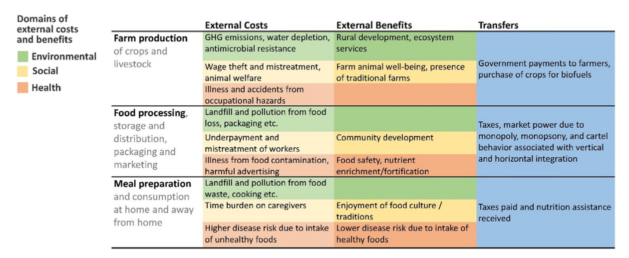
FIGURE 2. Structure and example elements for true cost accounting to guide food choices. Note: Rows are grouped by stage of product life cycle, from farm production through postharvest transformation and delivery, to final use in meal preparation and consumption. Colors indicate the three domains of external costs, defined in terms of environmental sustainability and natural resource use in green, social sustainability and equity in yellow, and health outcomes for the population in orange. Columns show examples of external costs, external benefits, and transfers within the population where one person's loss is another person's gain. This accounting framework was developed for Martinez and Masters [11] as part of the Food Prices for Nutrition project (https://sites.tufts.edu/foodpricesfornutrition). GHG, greenhouse gas.