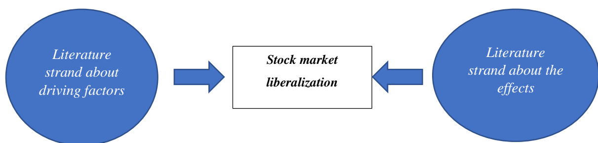
Figure 1: Literature strands of stock market liberalization

Also, a significant number of studies have examined the effects of liberalization in emerging markets, forming the second strand of the literature. In this survey, we aim to provide a comprehensive assessment of whether emerging stock markets benefited from liberalization. We expect that our survey, along with the survey of Koepke (2019) in the first strand, will complete the literature about stock market liberalization.