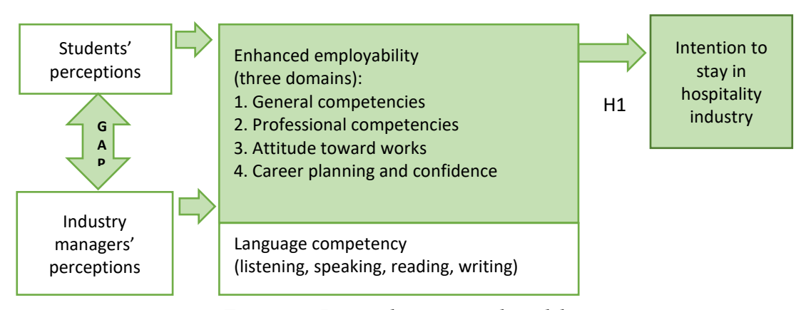
Figure 1. Research conceptual model

H<sub>1</sub>: Student intern employability has a direct effect on their intentions to remain in the hospitality industry.