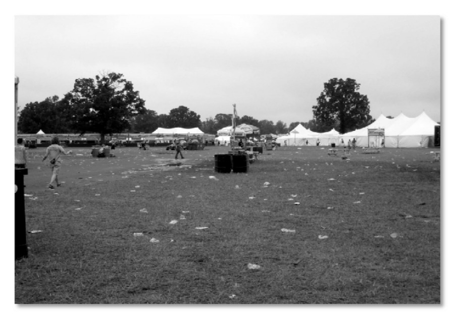
Figure 5 - Litter and environmental damage in the main festival areas

"Yeah, I'd like to see more going on outside the concert areas and um, definitely more organisation around more um, a community sense out there with...with focus on...I mean, I don't if you were there when everyone leaves, the place is destroyed and it's just Trashed and while Clean Vibes does an amazing job of cleaning up after everyone...people should clean up after themselves."