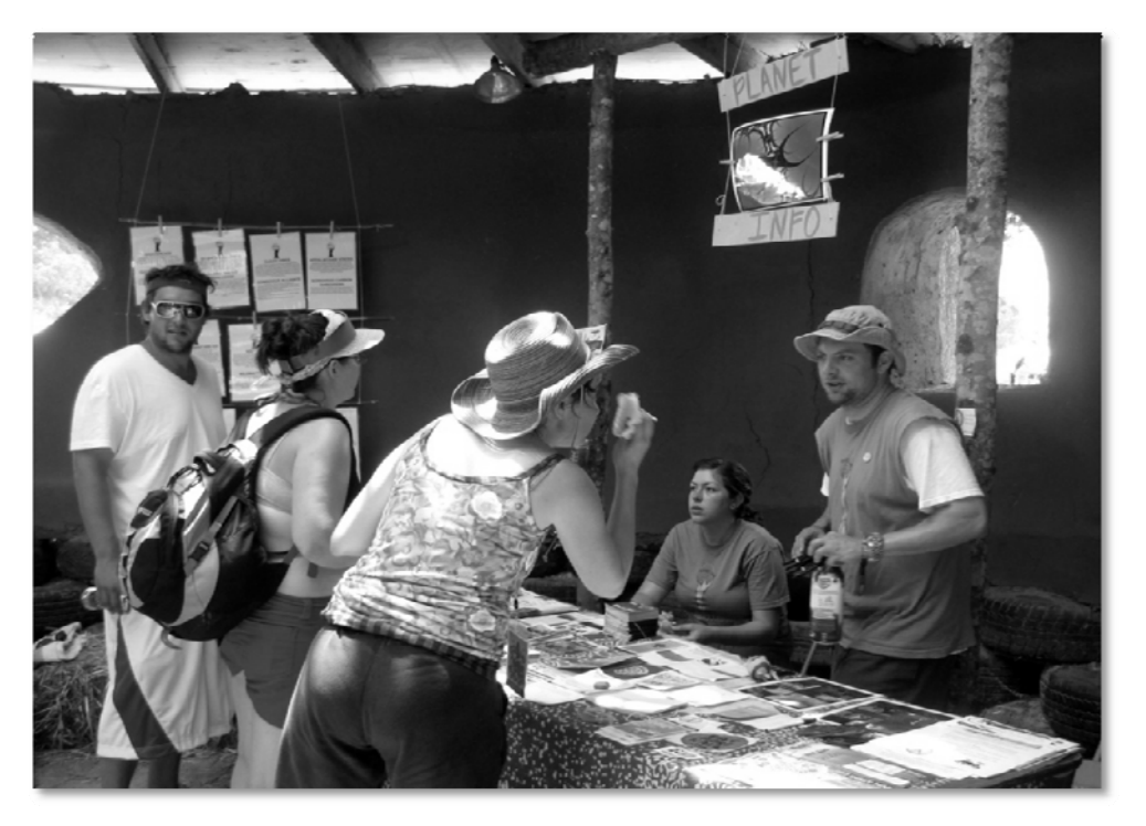
Figure 3 - Plant Roo information booth

Through the use of micro-ethnographic research methods the researchers discovered that the general volunteers were aware of the basics of the environmental outreach and promoted it within the festival but the key to 'green' promotion and success relied more heavily on the Planet Roo Ambassadors. These specialist volunteers, who had an environmental NGO or higher education backgrounds, worked both within the Planet Roo village and throughout the festival spreading both the message of the festivals 'greening' efforts and how they could contribute to the success of a more sustainable Bonnaroo while also educating event attendees on various environmental issues. The Planet Roo Ambassadors engaged with