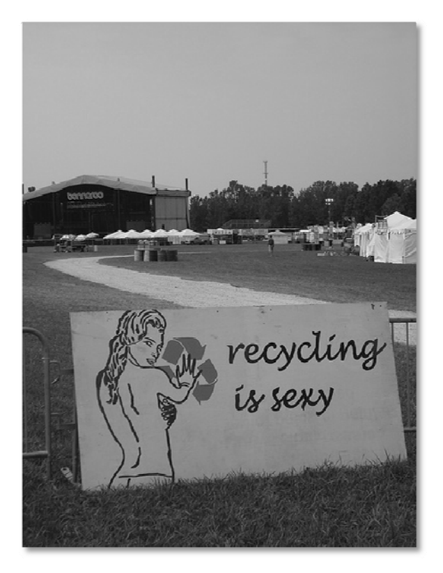
Figure 2 - sustainability signage

Brooks (2007) and Laing & Frost (2010) have noted the importance of properly engaging event stakeholders in order for an event to succeed in its sustainable efforts. From the research gathered in this study, the impacts of all volunteers on Bonnaroo's 'greening' policies are significant in certain areas (i.e. waste diversion) but the inconsistencies between the policies and practices that Bonnaroo promote and the actual behavior and knowledge od volunteers and attendees lead to legitimate questions about the success of their sustainability efforts. The analysis of data collected in this research shows room for improvement by incorporating more 'greening' knowledge into the volunteer training process, to give them the tools to better educate and inspire festival goers, which will ultimately increase the overall success of their 'greening' practices. With upwards of 70-80,000 people in attendance to a festival like Bonnaroo, the chances of a negative environmental impact are significant without proper training and 'greening' promotion. Through the ethnographic data collected, the researcher discovered that waste diversion was the only 'greening' programme that the large majority of festival goers were aware of and actively participated in. When asked about their knowledge of greening activity on site, the following responses were typical: