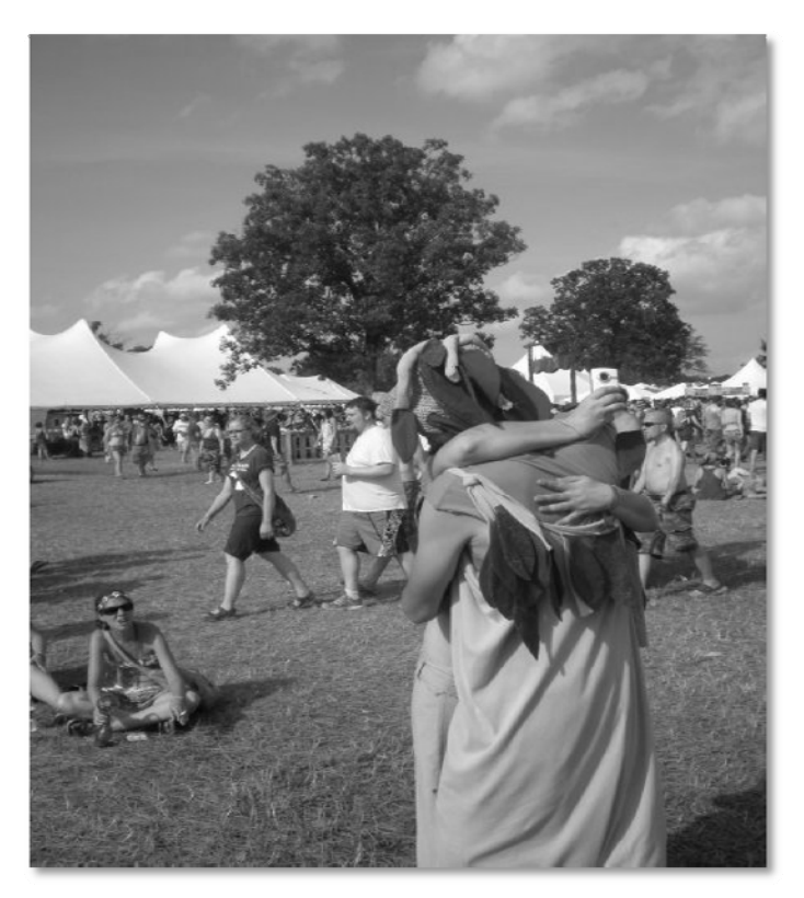
Figure 4 - Planet Roo Ambassador 'tree hugging' a festival attendee

We can consider these spaces and activities to be a manifestation of the hyperreal because they stand in place of less sustainable aspects of the festival, whose meaning is masked by the high-profile greening activities that take place on site. For example, in 2005 research found that attendees travelled from all 50 states of the USA and from 24 countries (Arik & Penn 2005). Our research found that the majority of attendees asked came using air and / or private cars as transport, agreeing with the 2005 study which found that 92% of attendees