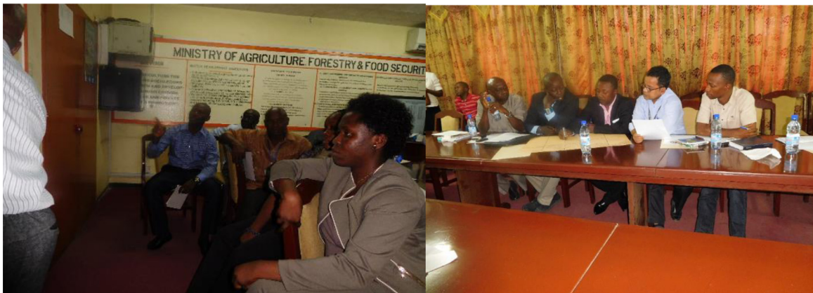
Fig. 1. MAFFS officials (left) and NGO professionals (right) preparing their presentation.

adequately record all relevant information emerging from the interviews. A social network analysis (SNA) program, UCINET, was used to organize linkages among actors as identified by research and extension actors during the workshops. Representatives from these key institutions were asked to indicate the number of ties they have with others and as well as the strength of the linkages. The freeware program contained in UCINET known as NETDRAW was used for visualizing networks into a sociogram. This helped in establishing the underlying patterns of social relations of actors in the SRI innovation (Table 4, Fig. 1, Fig. 2, Fig. 3).