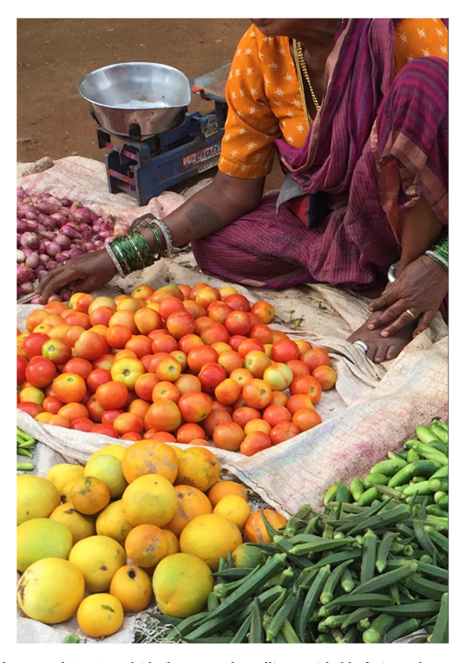
Photograph 2. A roadside 'heap' vendor selling perishable fruits and vegetables in an APCAPS village.

like that in our village. We support each other." (030 445, 46 years, IDI). In another example, one farmer explained how he benefits from the exchange of produce with friends at the local mandal headquarter market: