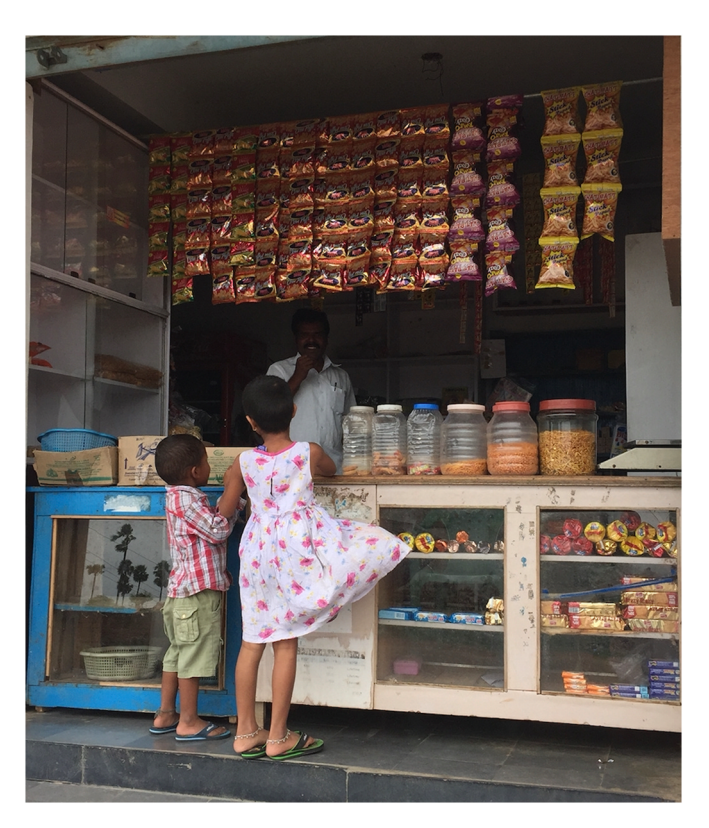
Photograph 3. Children buying snacks from a local shop in an APCAPS village.

Participants also expressed their concerns about children's exposure to food vendors when travelling unsupervised to and from school, and also within the school food environment. One participant explained, "Anywhere at school, the shops are placed next to the school, is it not? They will eat chocolates at school." (F, 030 088, 20 years, Q-GIS). Another mother, employed as a cook at a local school, described her struggles to prevent children from consuming unhealthy snacks and sweets at school, and referred to a photograph she had taken of a child holding a small sweet cake in the palm of his hand: