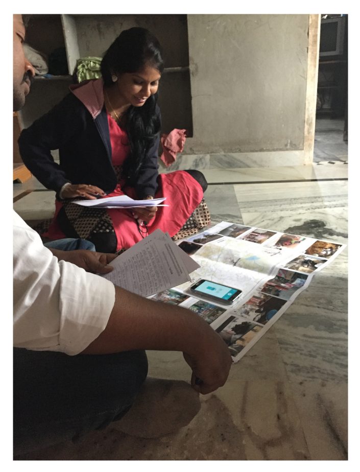
Photograph 1. The use of a Q-GIS chart during a follow up interview.

including dust, dirt and pollution from passing vehicles, and contamination by pests such as flies and mosquitoes: