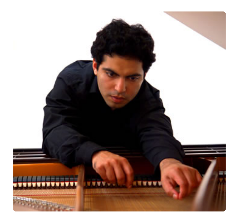
eContact! 13.2 — Keyboards + Live Electronics: The Performer's Perspective / Claviers + « live electronics » : La perspective de l'interprète (April / avril 2011). Montréal: Communauté électroacoustique canadienne / Canadian Electroacoustic Community.