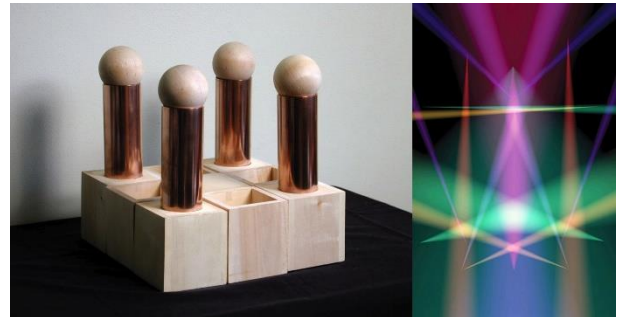
Figure 4: The left image is the “ Variations ” interface exhibited in the First Beijing International New Media Arts Exhibition, 2004. The right image is the “ Buddha Light Painting ” in the Art in the Digital Era exhibition in Guangzhou, China, 2010.

These two examples illustrate how digital art has expanded the creative options available to the contemporary artist. While it is beyond the scope of this presentation to explore all the evolutionary and revolutionary changes made to art making, the Internet contains hundreds of websites of digital artists.