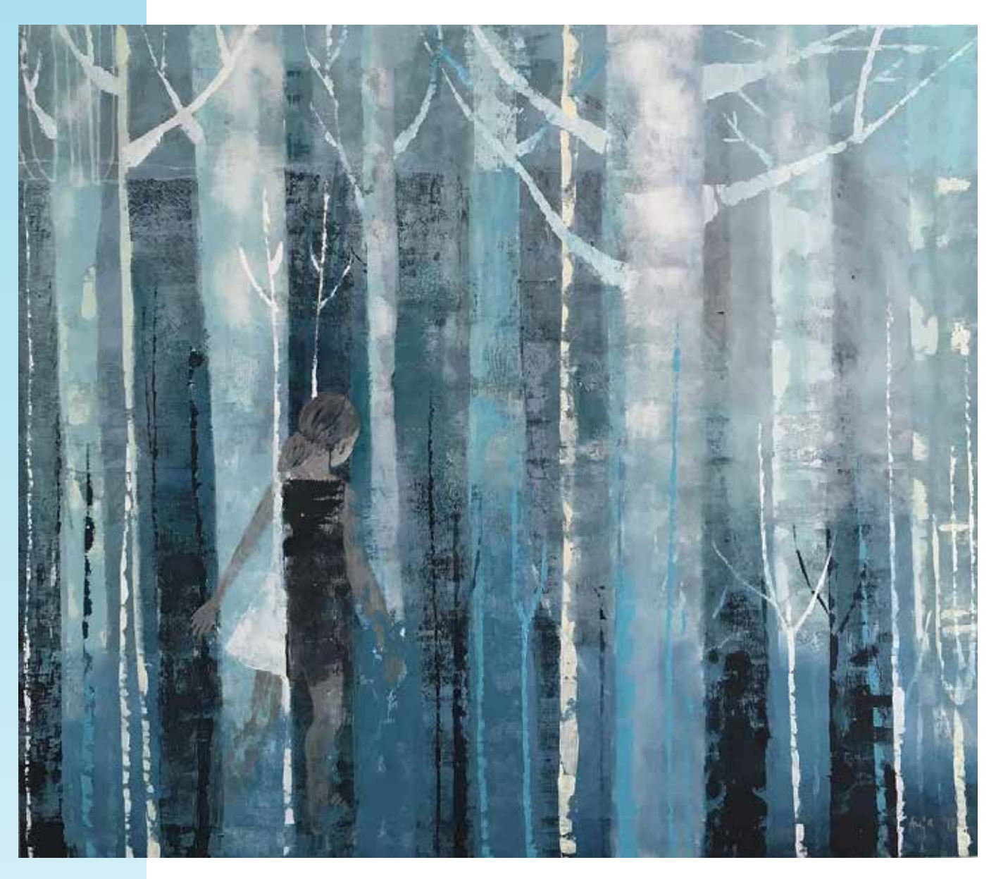
Anja Kranjc: The Incarnation of the Wilderness III