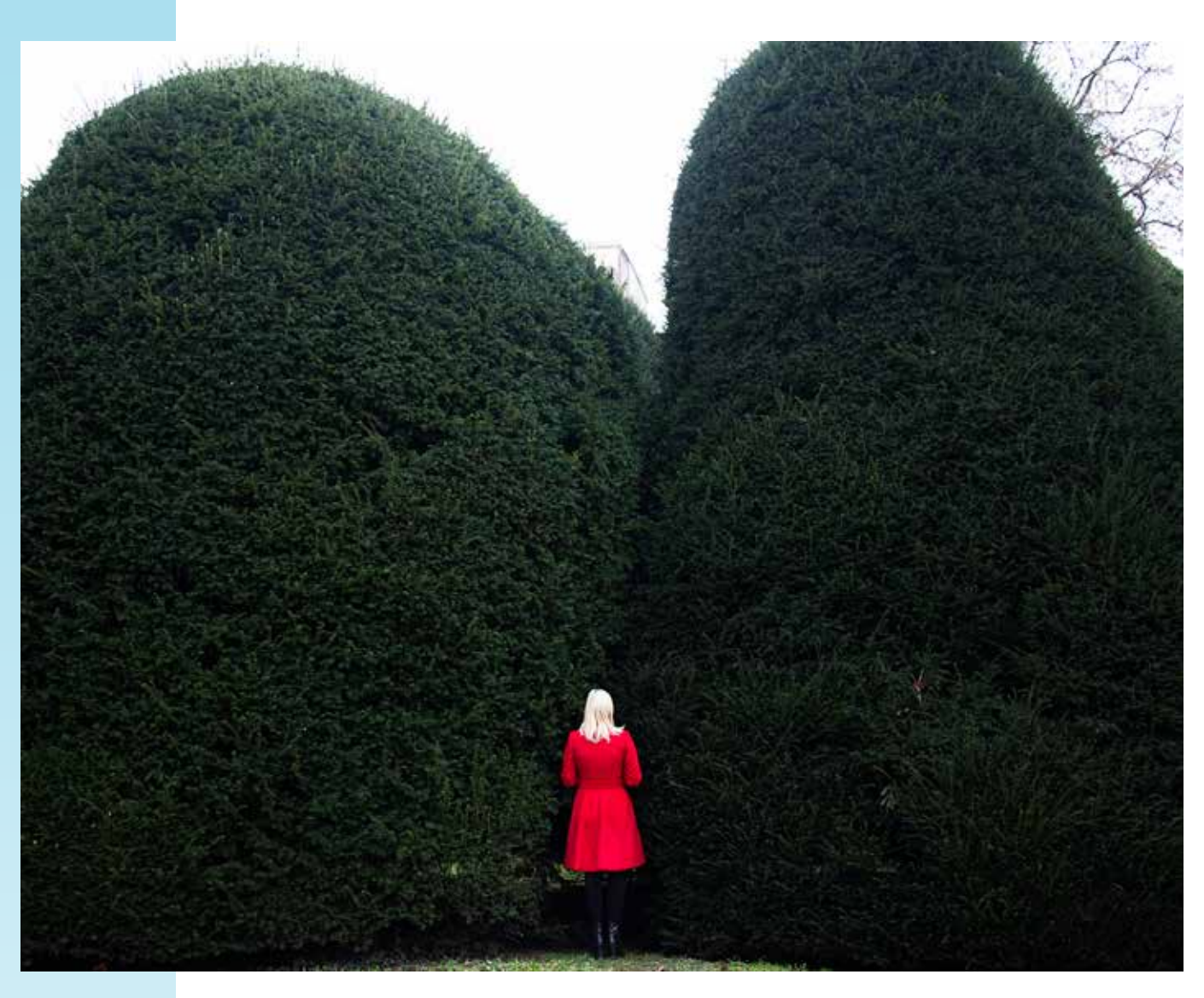
Jasmina Vidmar: Traces