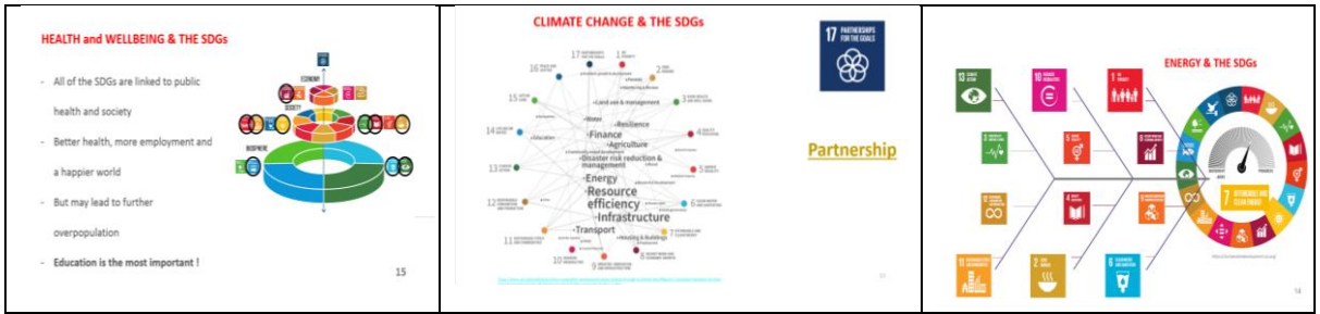
Figure 3. Example summary slides showing graphic representation of the links

The next step was to consider the two assessment tasks. The first was a group presentation. This was discussed, separating out the transferable skills (research, communication, teamwork) from the technical ones (content) and increasing understanding of the rationale for the task. We looked back at the list of topics, reminded ourselves about the SDGs and agreed that the students should all bring their thoughts the following week. They concluded unanimously that the biggest challenge with the SDGs is that they are interdependent, making it difficult to consider any of them in isolation. For me, this was interesting evidence of inquiry-based learning and showed that they really had reflected, both individually and in collaboration, between classes. Students were organised into small groups and the selected topics (figure 2) randomly allocated between them, the brief being to research the environmental management topic and which specific SDGs were related to it. In all cases, complex interactions were revealed, with multiple links between SDGs so that management action on any of the topics would (or could) contribute to achieving several simultaneously. These were presented in class as formative assignments, receiving peer and teacher comments. Examples of summary slides from the final, summative, presentations are included as figure 3.