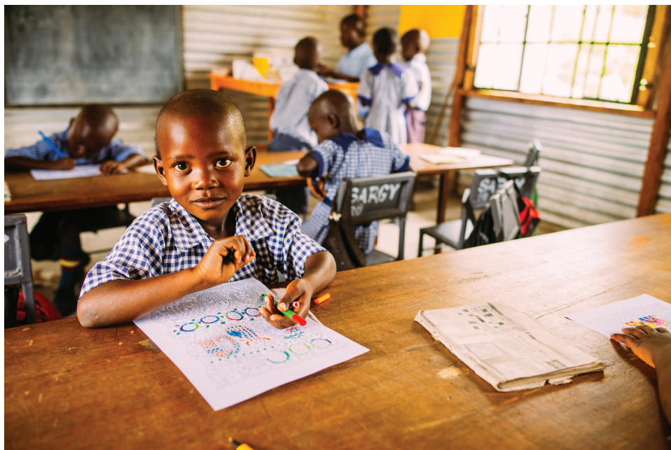
Figure 2. Supplementing nutrient-deficient diets with livestock-derived foods can have a wide range of health and social benefits.

Inadequate micronutrient intake during gestation has far-reaching adverse consequences through fetal programming (e.g., impaired growth of fetuses and infants and high risk of metabolic syndrome). Micronutrient supplementation can reduce the risk of being born with low birth weight but there is virtually no literature investigating the role of livestock product consumption relative to nutritional outcomes of pregnant women or their off-spring in Africa and South/Southeast Asia. Old studies conducted in Asia have reported direct effects of animal protein intake on milk output of breastfeeding women and infant breastmilk consumption. For example, a study in Burma (Khin-Maung-Naing and Tin-Tin-Oo, 1987)