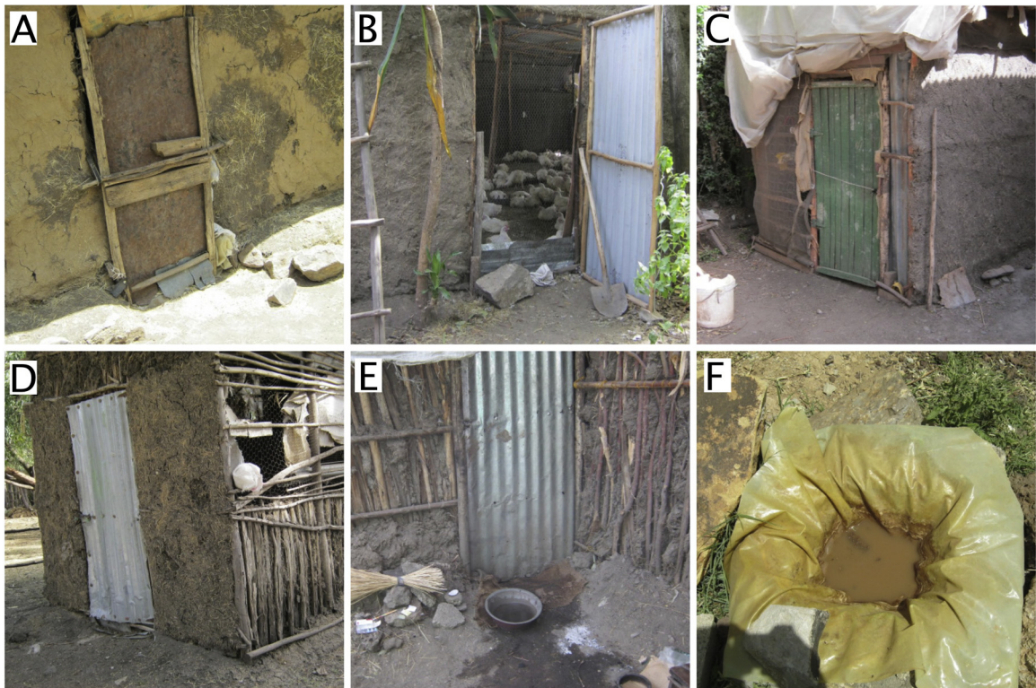
Fig. 2. Examples of chicken housing on semi-intensive holdings in and around Debre Zeit, Ethiopia. Materials used in construction made cleaning and disinfection impractical. Footbaths were only used on 2 of the 30 semi-intensive production premises (pictures E and F) and in both cases were unlikely to be effective.

identified as an important constraint by some semi-intensive producers.