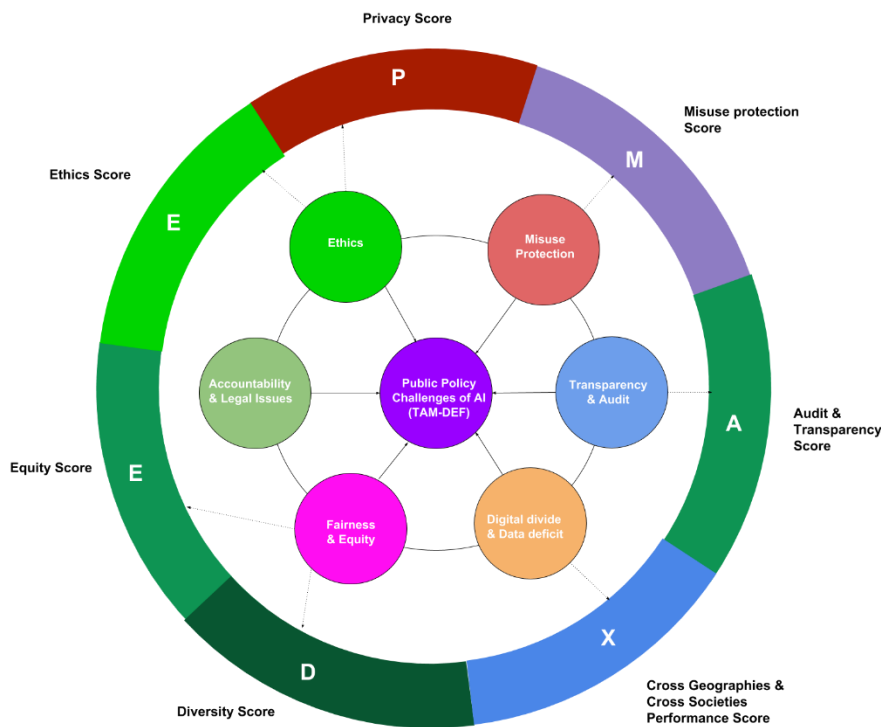
Figure 4: An integrated view of DEEP-MAX Scorecard under TAM-DEF framework for Public Policy challenges of AI