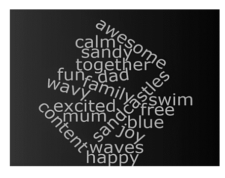
Figure 2. WordCloud: Emotions and the Sea

Hedonic wellbeing, or 'an increased emotional state of happiness', was a strong self-reported outcome in this work – 100% of the sample expressed positive emotions or feelings when asked how it felt to be by the sea. These were almost all expressed in terms of present moment/embodied emotions – during the interview itself. Figure 2 below shows the most commonly expressed terms and emotions in relation to a question on 'how being at the sea makes you feel'. The emotions expressed are primarily positive and include multiple mentions of 'happy', 'joy', 'together', 'fun', 'relaxed', and 'family'.