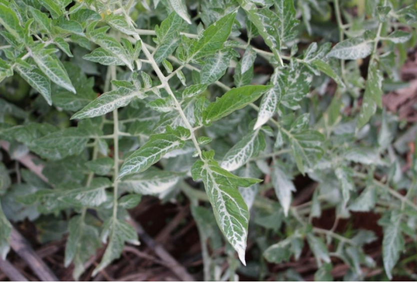
Picture 1. Tomato crop covered by the fungicide mancozeb