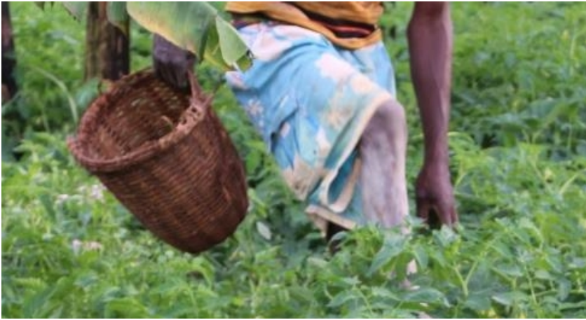
Picture 2. Operator harvesting tomatos with legs covered by the fungicide mancozeb