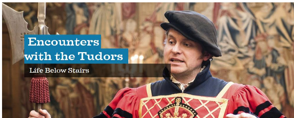
Daily 11.00-16.00 Between Master Carpenter's Court and Chapel Court

This summer, immerse yourself in a living Tudor world as we introduce you to the staff that fed Henry's courtiers and guests. Enjoy the smells of ingredients sourced from across the globe to dazzle the King and his court, and see how they were transformed into complete dishes by a skilled team of cooks; there is even a chance to lend a hand turning the spit!