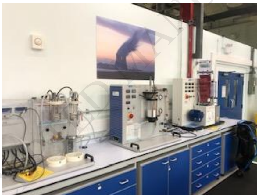
Figure 3 Laboratory layout and equipment at Greenwich