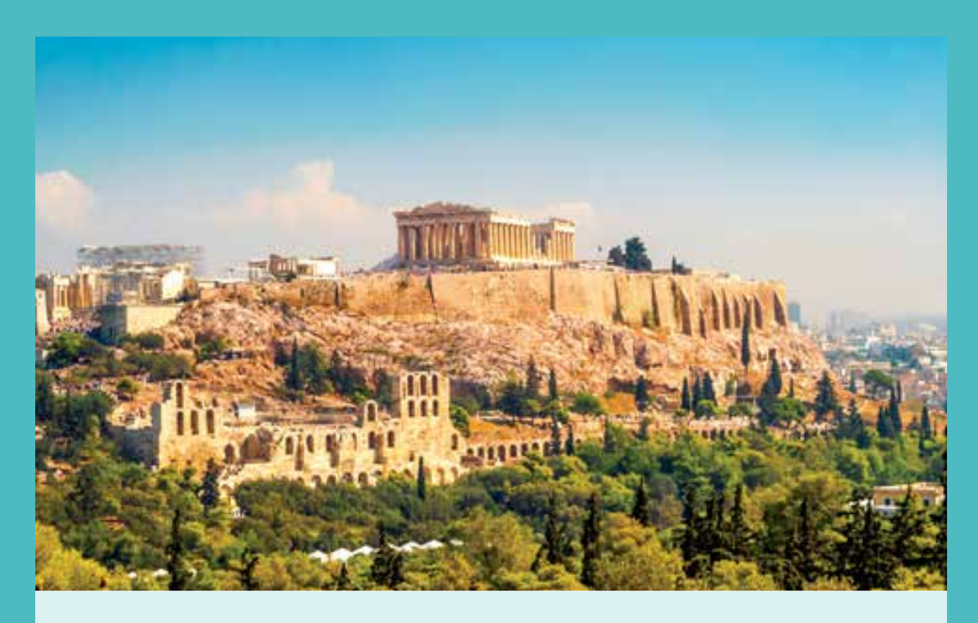
Athens · Greece Megaron International Conference Centre