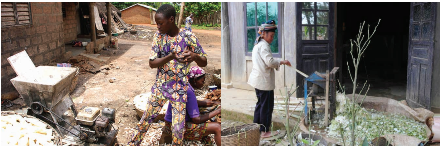
Small-scale simple machinery and equipment can significantly help women save their time and labor. Left: a cassava milling machine in Benin. Right: a sweet potato vine cutting machine for animal feeding in Vietnam.