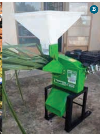
B: An improved chopping machine with a protection cover.

machine. Men pointed to the lack of durability and a constant demand for providing services as a major limitation to effective use of the chopper. Thus, there is need to ensure that choppers are safe to use and that farmers and local artisans are trained to repair the choppers. If the safety of the chopper is improved, the adoption rate could increase since women often expressed fear of operating it. Training a cohort of people in the community to provide services for