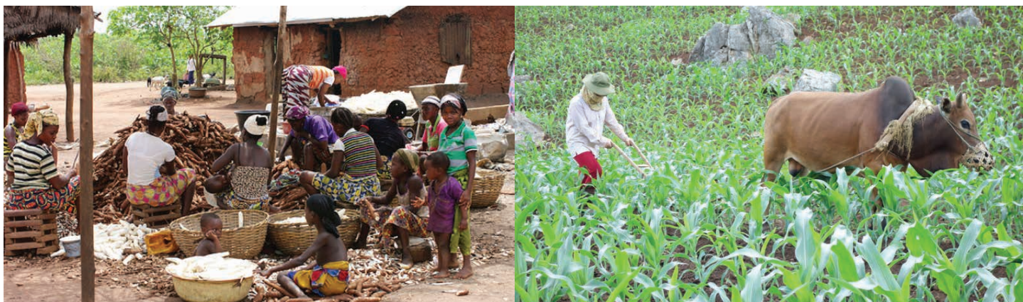
Many women's tasks are still manual across the global South. Left: women peeling cassava in Benin. Right: women working with an ox in Vietnam.