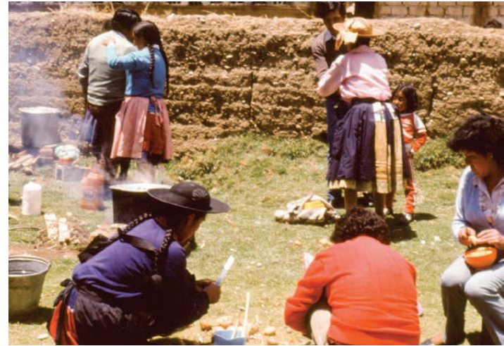
Women cutting potato for Papa Seca.

Evaluation of the drying boxes that researchers introduced showed, according to the findings, that “traditional methods dry the food products as quickly as the improved method”, despite its higher cost. The “improved” method was not adopted. If the researchers had talked to local women, who are the ones responsible for this processing activity, they would have learnt something different: the women were quite satisfied with sun-drying. What they urgently needed was improved