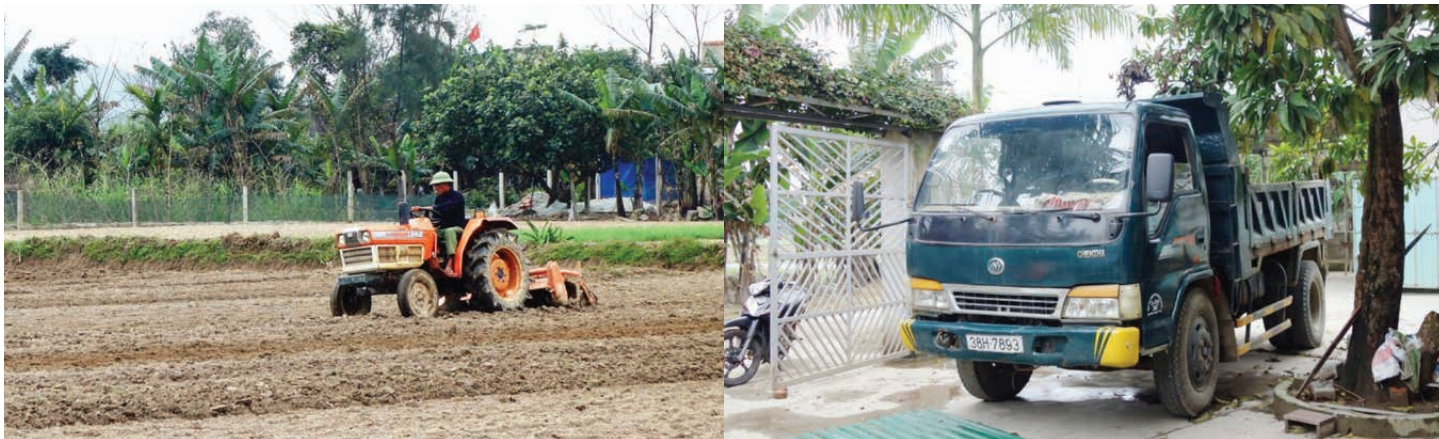
In general, big and expensive machinery are developed by men and used by men.

Please critically consider how the new technology/intervention is likely to affect different people, for example: a) Are there changes in gender division of labor in other farming and non-farming activities? b) Are there differences in men and women's perceived benefits and positive / negative changes they face? c) What are impacts of the intervention on different socio-economic groups and their roles in the community?