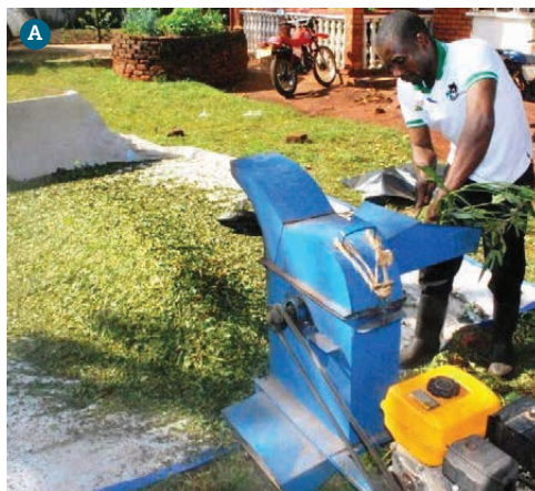
A: The pulley was not covered and thereby women were afraid that their children could be injured. The feeding tray was very short and when women farmers fed the vines, their fingers could touch the edge.

In Uganda, the silage chopper was introduced in order to make ensiling more efficient and to reduce drudgery associated with chopping vines using pangas (sickles). However, this research shows that mechanization which is not friendly for specific users or well adapted to local conditions may deter adoption or limit usage and usefulness of technology. For example, women were afraid to use the chopper because of safety concerns. This limited their ability to venture into silage making on their own since they had to depend on men to operate the