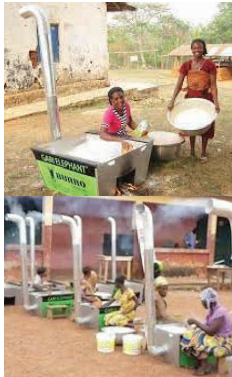
Smoke-reducing gari fryers in Nigeria.

In Nigeria, women are highly involved in cassava processing, particularly gari. Women typically process gari at a processing centre and pay fees for the use of a fryer and other services (e.g. press), as they do not have this equipment at their home. However, unfortunately, the frying equipment used in many locations exposes women to harmful smoke for many hours a day. Smoke-reducing gari fryers have been developed in the region to