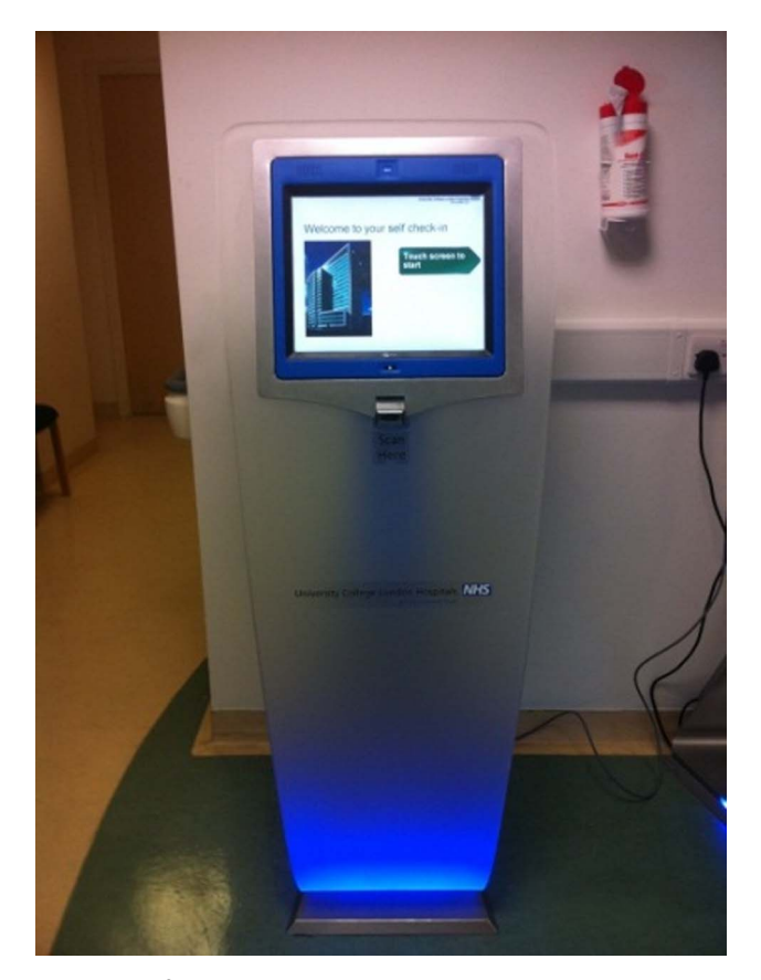
Figure 1 Self-service check-in kiosk.

relation to patients managing their own long-term conditions, for example, diabetes, and anti-coagulant medication: