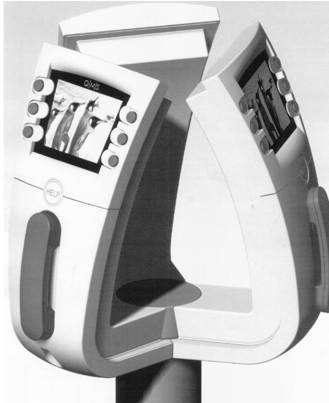
Fig. 5. The Personal Information Point. Note the telephone handset for audio output, the LCD screen for visual output and the 6 buttons arranged either side of the screen for input. To use the PIP, the user would have to be able to see the screen, hear the audio and simultaneously hold the handset and press the buttons.