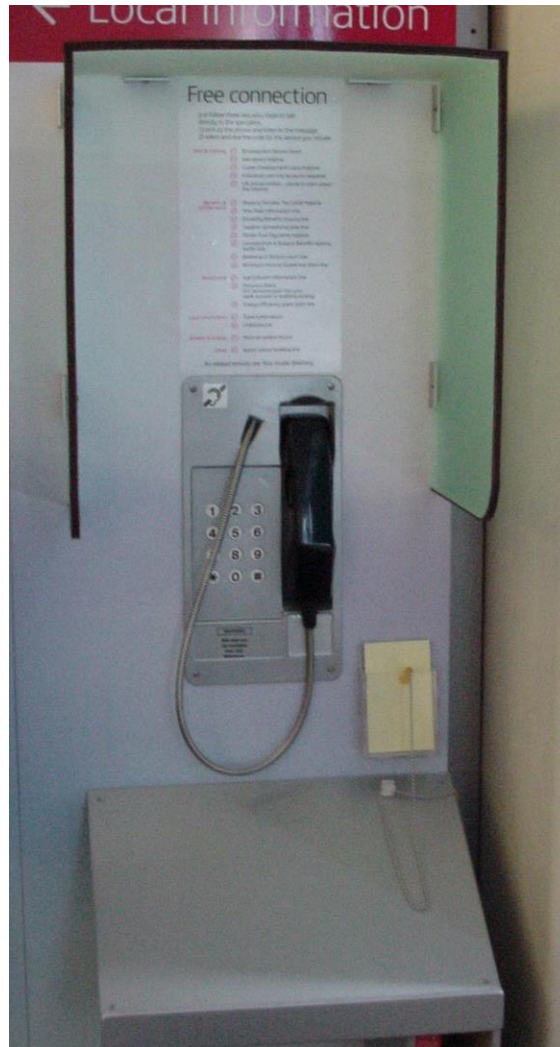
Fig. 7. The Your Guide telephone. Note the cable obscuring the sunken, rubberized buttons and the black foam rubber bumper around the plastic shroud to protect against people bumping their heads on the hard plastic.