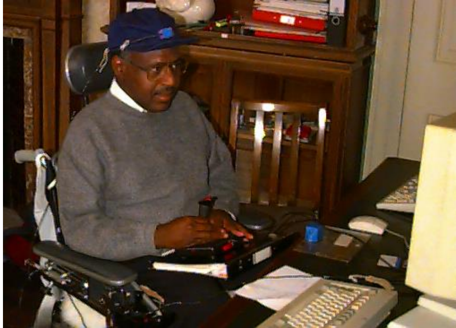
Fig.1. Jester in use. Note the plastic cube mounted on the baseball cap for head gestures and the analogue joystick for hand gesture. Both could be used independently or combined.