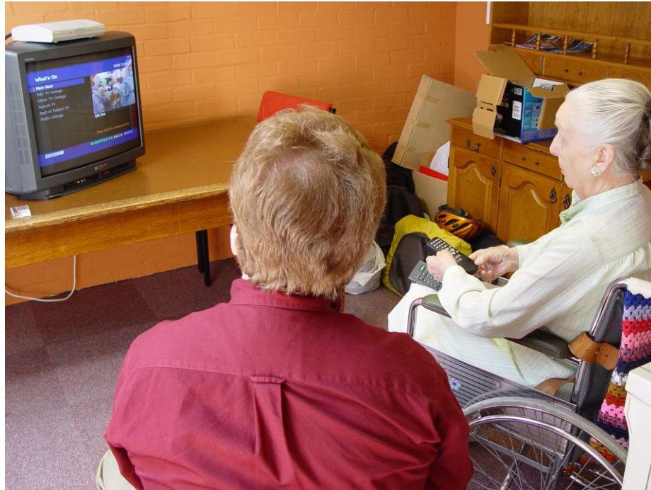
Fig. 3. The digital set-top box user trials. Note the pale grey box on top of the television set and the multiple remote controls on the user's lap.