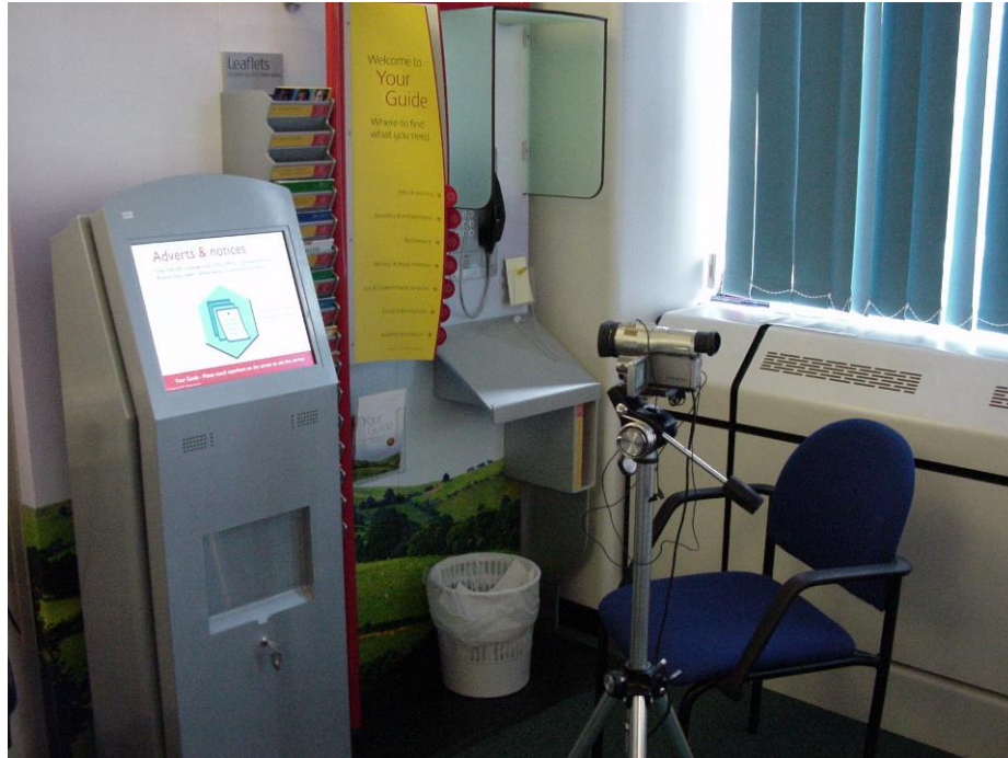
Fig. 6. The Your Guide kiosk, its surround and the free-phone telephone. Note the plastic shroud around the telephone and the black foam rubber that had to be added to stop taller people from hitting and hurting their heads.