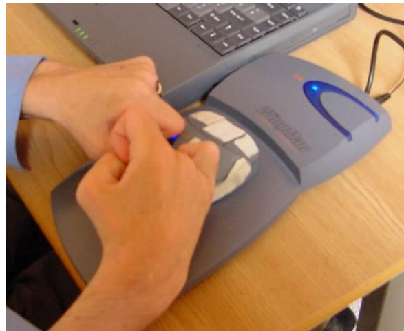
Fig. 2. The Wingman Force Feedback mouse being used by a user with cerebral palsy. Note the user's curled fingers and the hockey tape added to the buttons to stop the user's fingers slipping off them.