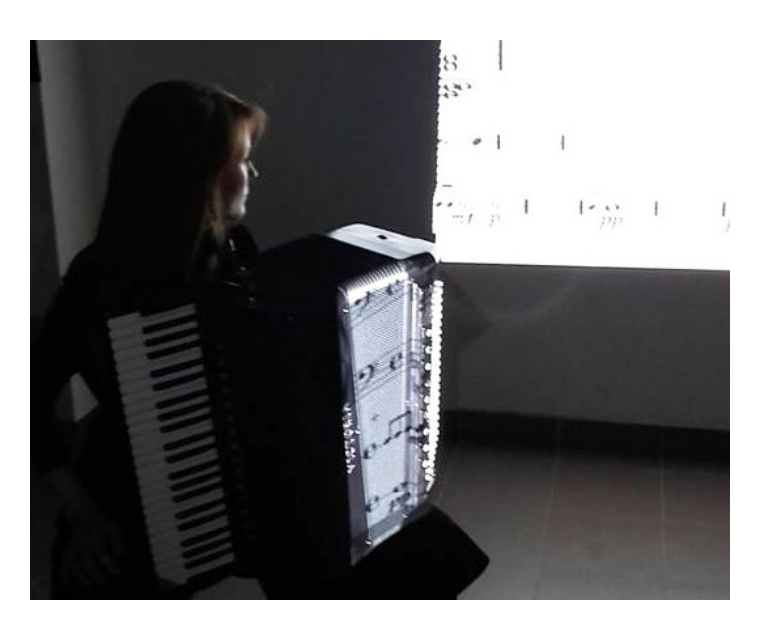
Figure 3. The performer during the final rehearsal

According to the request of the performer, we created a printable study score. This score was composed of 13 pages (one for each section of Studio I) with an introduction that described how the rhythmic density evolves in the sequence of sections and how sections succeeded one another. In each page, the harmony and a sample of the possible rhythms were notated. After some private study, the performer required to have a more compact version of the score, with all the chords on one page, to have a better overview of the overall structure. We generated one pattern for each section as an example of its rhythmical structure.