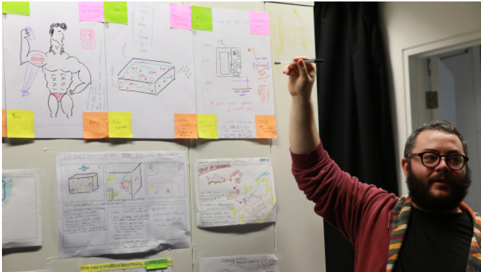
Figure 1 Bootlegging presentation