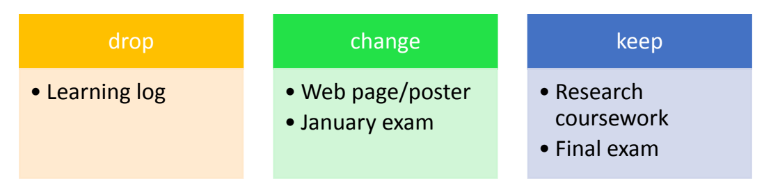
Figure 3: Change decisions

Decisions made fell broadly into three categories: